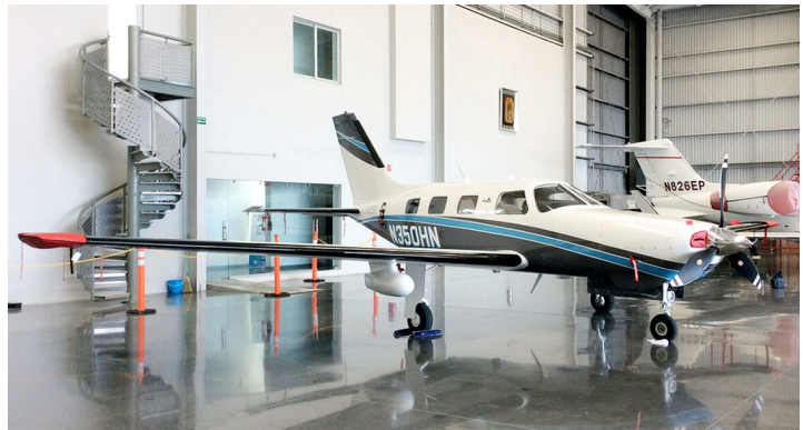
Piper PA-46 Malibu Wingtip Pads