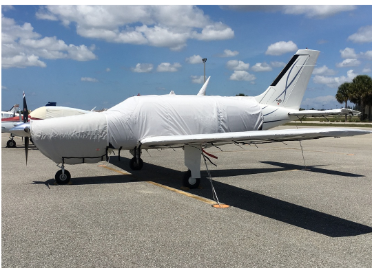
Piper Malibu Extended Canopy Cover, Engine, Wing & Horiz. Stab. Covers