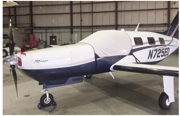
Piper Malibu/Mirage Cockpit Cover, Engine Plugs