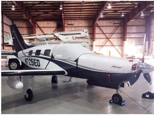
Piper Malibu/Mirage Cockpit Cover, Engine Plugs