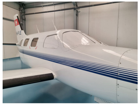
Piper PA-46 Malibu Cockpit Heatshields