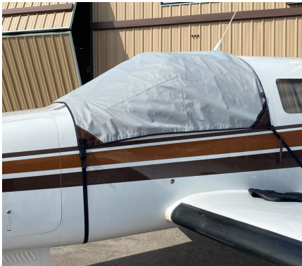
Piper PA46-310P Travel Weight Cockpit Cover