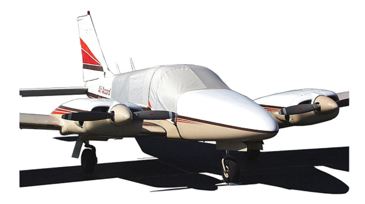
Piper Seneca PA-34 Canopy Cover

Travel Covers are made with Silver Solution-Dyed Polyester fabric and only lined over the windshield to save weight. The material is lightweight and more compact for easy stowage in the aircraft. The polyester material is water resistant, but only intended for occasional use outside. We also have an ultra lightweight material available for fitted hangar dust covers. For daily outdoor use, the non-travel Sunbrella Cover is the best choice.