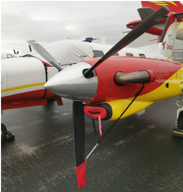
Piper PA-42 Cheyenne III Cockpit Cover, Prop Tie/Exhaust Cover, Inlet Plugs Piper PA-42 Cheyenne III Prop Tie/Exhaust Cover, Inlet Plugs