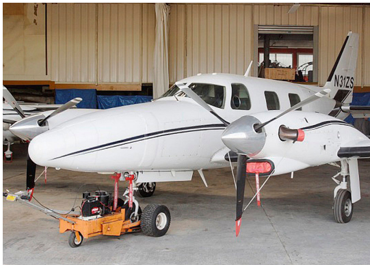
Piper Cheyenne IIXL Prop Tie/Exhaust Covers, Intake Plugs