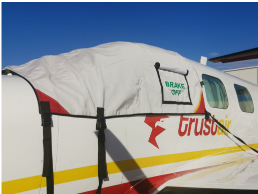
Piper PA-42 Cheyenne III Cockpit Cover