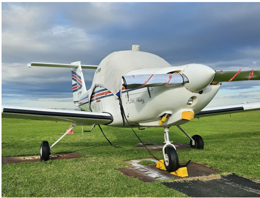
Piper PA-38 Tomahawk Canopy Cover