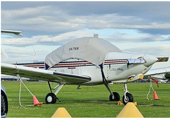
Piper PA-38 Tomahawk Canopy Cover

This cover type is made from Silver Acrylic Sunbrella canvas and is 100% lined with a soft and smooth microfiber. Bruce's Custom Covers developed this material combination especially for aircraft protection. The outer material is medium weight and treated for water resistance, UV resistance and anti-static buildup. The inner lining is a very soft and smooth microfiber to prevent scratching. The material is very reflective, and tests show that the cabin interior temperature can be reduced to near-ambient temperature on the hottest of days. It is water, ice and snow repellent, yet breathable to allow moisture to escape from between the cover and the aircraft surface.