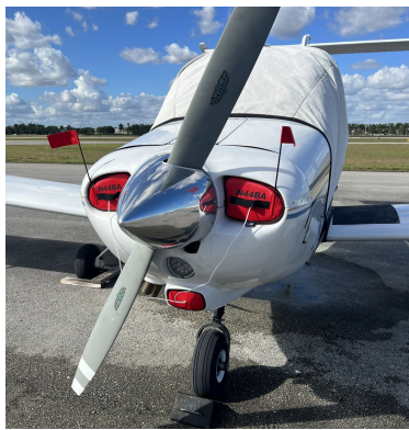
PA-38 Tomahawk Engine Inlet Plugs, Includes Carb. Inlet Plug Set of 3)