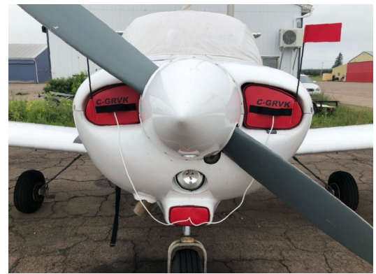
Piper PA-38 Tomahawk Engine Plugs