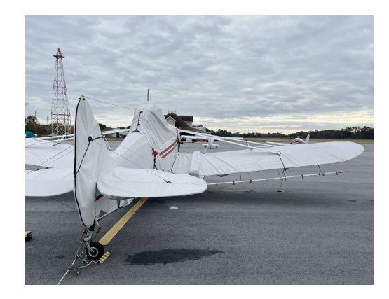
Piper PA-25 Pawnee Cover Set