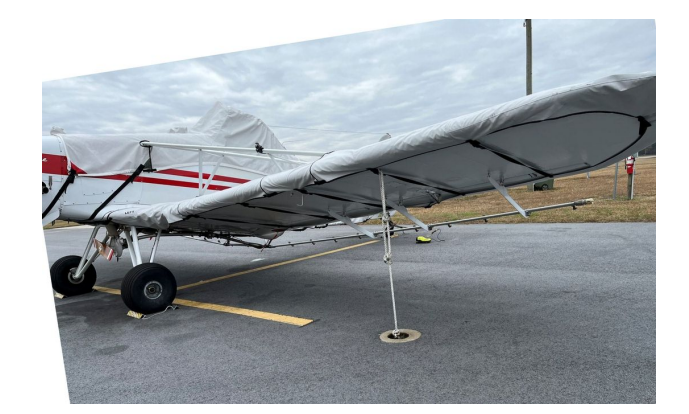
Piper PA-25 Pawnee Cover Set

WINTER USE MATERIAL - Made with Solution-Dyed Polyester fabric, this option is intended for seasonal use to aid in deicing, rain mitigation, or for occasional travel. The material is lighter and more compact, but more susceptible to UV damage and may have a shorter useful life if used continuously outside than the all-year use material.