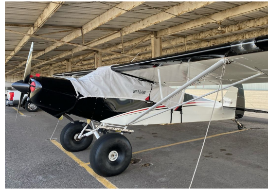
Piper PA-18 Super Cub Canopy Cover, Over Top Type