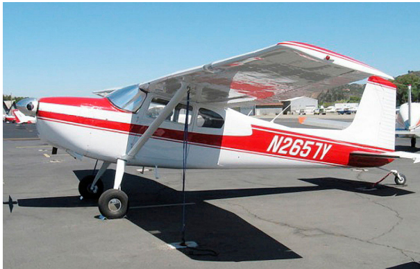
Cessna 180 & 185 Windshield HeatShield

Windshield Heatshields are interior sunshades for an aircraft's front windshield. The product is a unique composite of closed-cell foam with a silver mylar finish. The semi-rigid design is stiff enough to stand along the inside of the windshield using sun visors or window framing. It folds up flat and easily stores in the included storage sleeve. Some designs may require velcro and suction cups or split right and left sides. A Heatshield is an excellent short-term remedy for cockpit overheating. An external fabric cover is far more effective and practical for long-term protection.