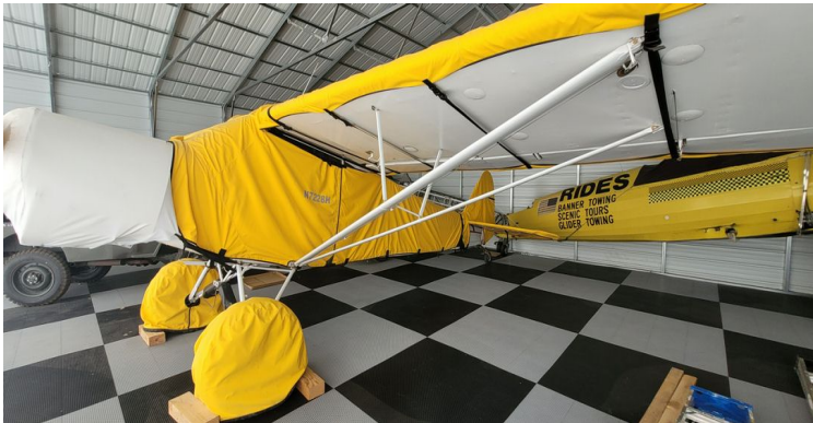
Piper PA-18 Complete Cover Set