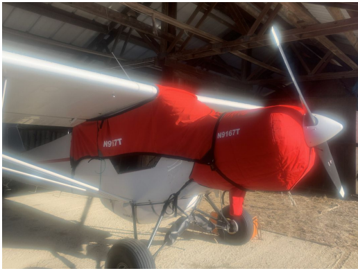
Piper PA-18 Super Cub Insulated Engine Cover, Canopy Cover