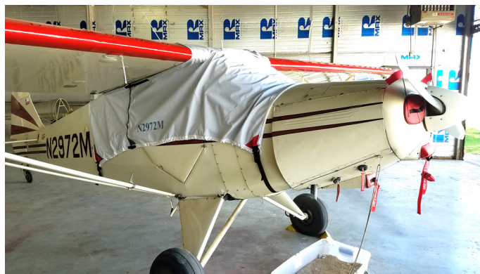
Piper PA-12 Wrap-Around Canopy Cover, Engine Plugs