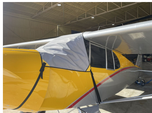
Piper PA-18 Windshield/Skylight Cover