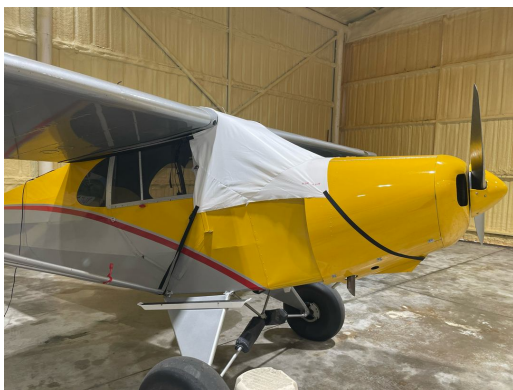
Piper J5A Windshield/Skylight Cover, test fit

This cover type is made from Silver Acrylic Sunbrella canvas and is 100% lined with a soft and smooth microfiber. Bruce's Custom Covers developed this material combination especially for aircraft protection. The outer material is medium weight and treated for water resistance, UV resistance and anti-static buildup. The inner lining is a very soft and smooth microfiber to prevent scratching. The material is very reflective, and tests show that the cabin interior temperature can be reduced to near-ambient temperature on the hottest of days. It is water, ice and snow repellent, yet breathable to allow moisture to escape from between the cover and the aircraft surface.