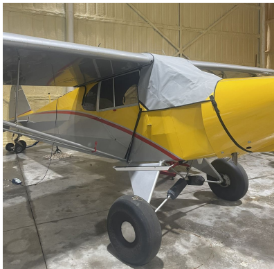
Piper PA-12: Super Cruiser Light Weight Travel Windshield/Skylight Cover

the hottest of days. It is water, ice and snow repellent, yet breathable to allow moisture to escape from between the cover and the aircraft surface.