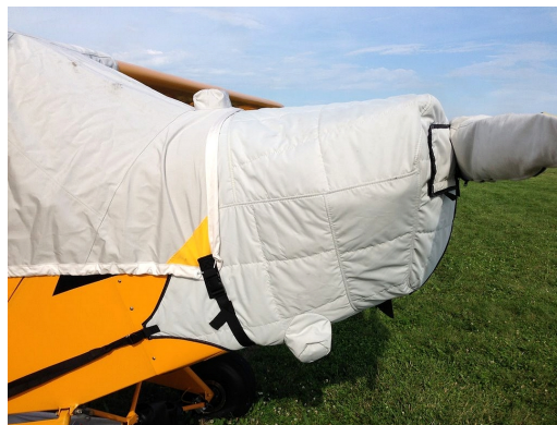
Piper J-3 Cub Insulated Engine Cover with added Pre-heater Access Flaps