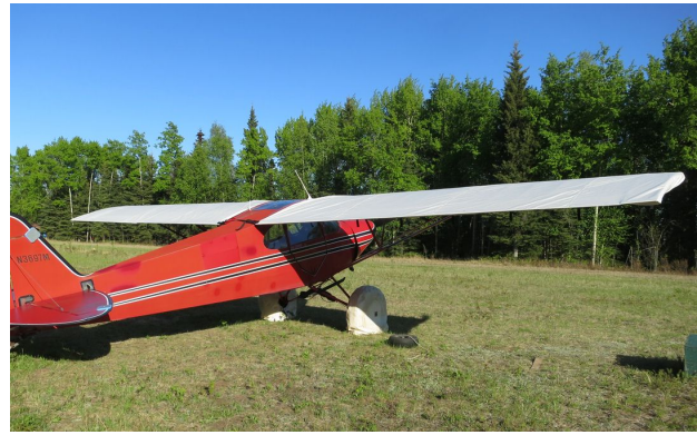
Piper PA-12 Wing Covers