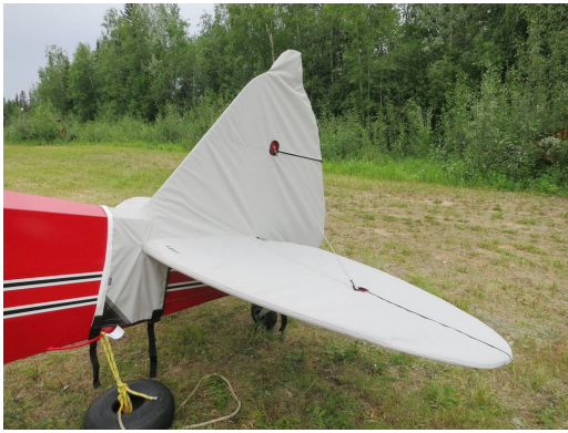
Piper PA-12 Abbreviated Empennage Cover