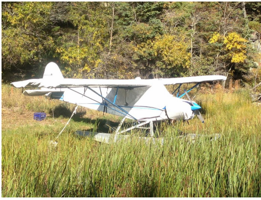
Piper PA-11 Cover Set