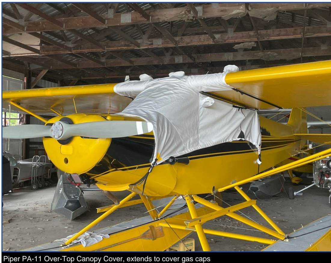
Piper PA-11 Over-Top Canopy Cover, extends to cover gas caps