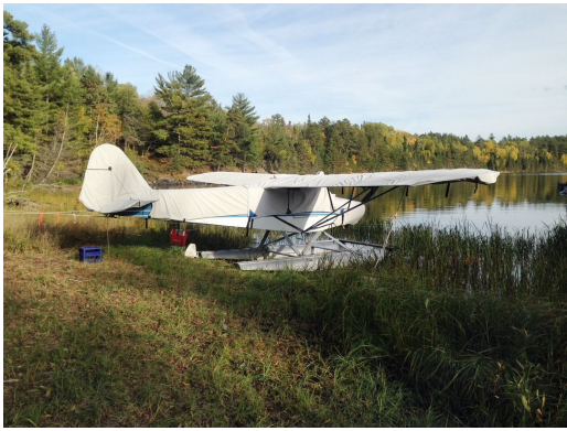
Piper PA-11 Cover Set