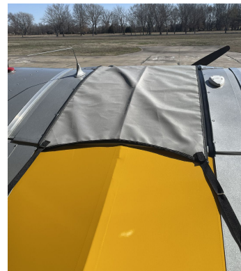
Piper PA-18 Windshield/Skylight Cover