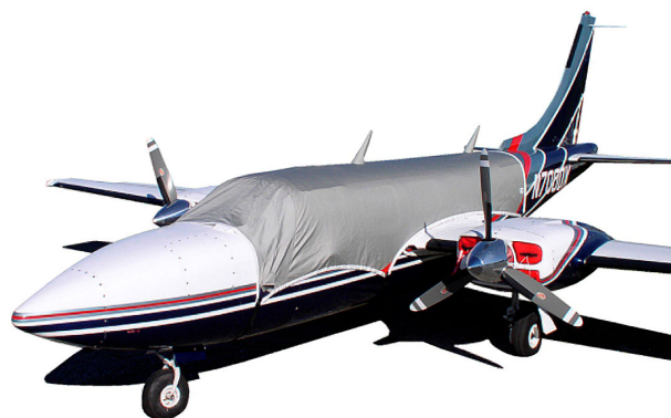
Aerostar Canopy Cover & Plugs