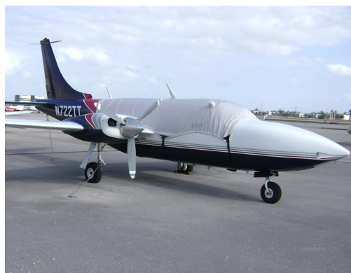
Aerostar Canopy Cover