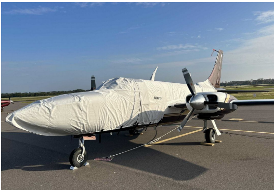
Piper PA-601 Aerostar Fuselage Cover (back to Horiz Stab)

The Piper PA-601 Aerostar Nose Cover is designed to cover the section of the fuselage forward of the windshield to the tip of the nose. It is secured with belly strapsThis cover type is made from Silver Acrylic Sunbrella canvas and is 100% lined with a soft and smooth microfiber. Bruce's Custom Covers developed this material combination especially for aircraft protection. The outer material is medium weight and treated for water resistance, UV resistance and anti-static buildup. The inner lining is a very soft and smooth microfiber to prevent scratching. The material is very reflective, and tests show that the cabin interior temperature can be reduced to near-ambient temperature on the hottest of days. It is water, ice and snow repellent, yet breathable to allow moisture to escape from between the cover and the aircraft surface.