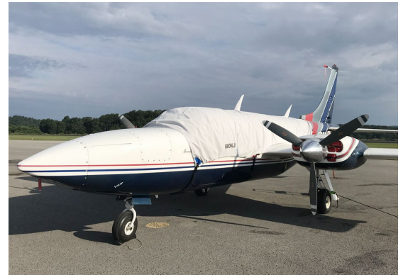
Smith Aerostar 600 Canopy Cover