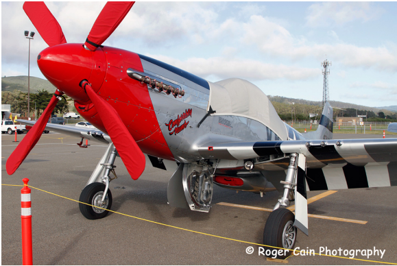
Yak 50 Insulated Hangar Blanket. 3D model North American P-51 Mustang Canopy Cover, Belly Scoop and Chin Scoop Plugs