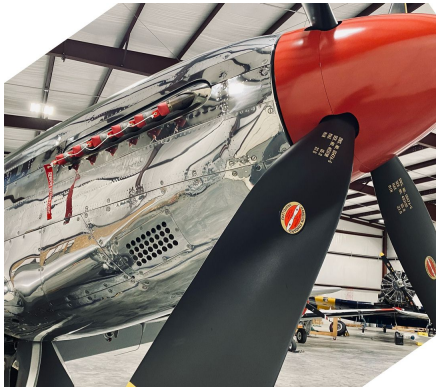
North American TF-51D Exhaust Plugs

Engine Inlet Plugs are custom fit for your North American Mustang P51 intakes, made with heavy-duty vinyl material, and stuffed with a single block of sculpted urethane foam. Each plug has a zipper that allows the foam to be removed and dried if necessary. Engine plugs have warning flags that are visible from the cockpit or 'remove before flight' streamers sewn onto the face of the plugs. Most plugs are imprinted with the aircraft registration number in black for an extra charge. Storage bag NOT included. Engine plugs may be inserted after flight when the engine is still warm. Engine Inlet Plugs are commonly referred to as Cowl Plugs, Intake Plugs, Cowl Blocks, Engine Blocks, and Engine Bungs.