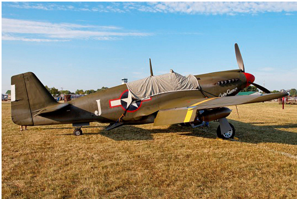
North American P-51A Canopy Cover