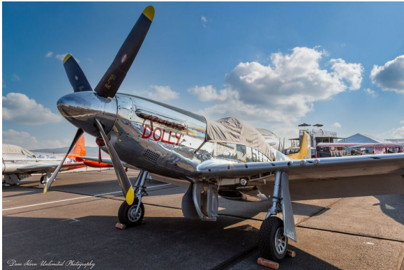
North American P-51 Canopy Cover

This cover type is made from Silver Acrylic Sunbrella canvas and is 100% lined with a soft and smooth microfiber. Bruce's Custom Covers developed this material combination especially for aircraft protection. The outer material is medium weight and treated for water resistance, UV resistance and anti-static buildup. The inner lining is a very soft and smooth microfiber to prevent scratching. The material is very reflective, and tests show that the cabin interior temperature can be reduced to near-ambient temperature on the hottest of days. It is water, ice and snow repellent, yet breathable to allow moisture to escape from between the cover and the aircraft surface.