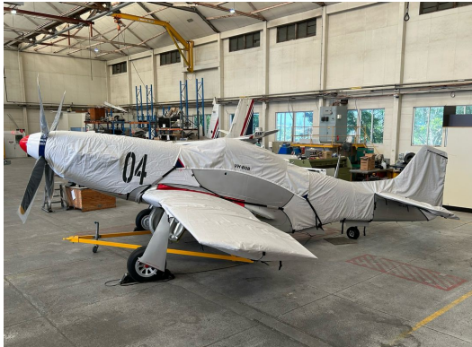
North American Mustang P51 Engine Cover