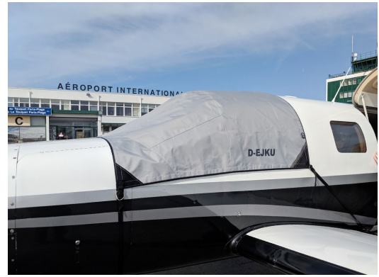
Piper PA46-350P Malibu Mirage Travel Cockpit Cover