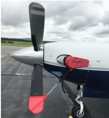
Piper Meridian Prop Tie/Exhaust Covers