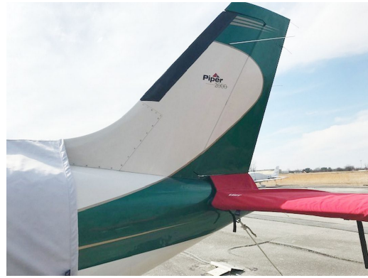
Piper Malibu/Mirage Horizontal Stabilizer/Tailcone Cover