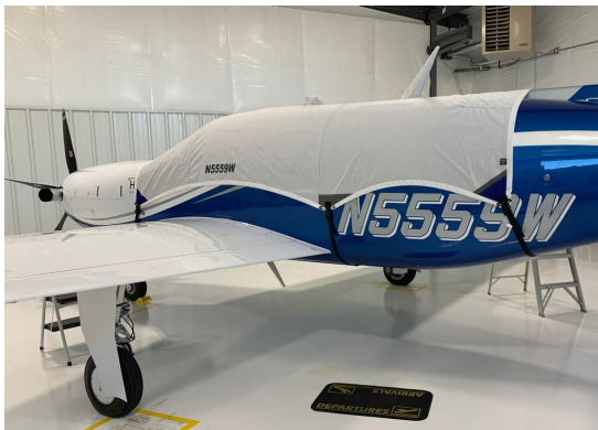
Piper Meridian Canopy Cover

This cover type is made from Silver Acrylic Sunbrella canvas and is 100% lined with a soft and smooth microfiber. Bruce's Custom Covers developed this material combination especially for aircraft protection. The outer material is medium weight and treated for water resistance, UV resistance and anti-static buildup. The inner lining is a very soft and smooth microfiber to prevent scratching. The material is very reflective, and tests show that the cabin interior temperature can be reduced to near-ambient temperature on the hottest of days. It is water, ice and snow repellent, yet breathable to allow moisture to escape from between the cover and the aircraft surface.