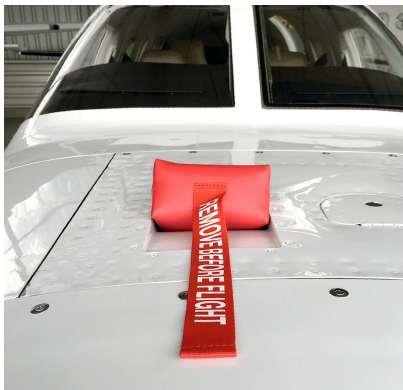
Piper PA-46-500TP Engine Cowl Top Plug (Generator Intake)

Engine Inlet Plugs are custom fit for your Piper PA-46-500TP, 600TP Meridian, M500, M600, M700 intakes, made with heavy-duty vinyl material, and stuffed with a single block of sculpted urethane foam. Each plug has a zipper that allows the foam to be removed and dried if necessary. Engine plugs have warning flags that are visible from the cockpit or 'remove before flight' streamers sewn onto the face of the plugs. Most plugs are imprinted with the aircraft registration number in black for an extra charge. Storage bag NOT included. Engine plugs may be inserted after flight when the engine is still warm. Engine Inlet Plugs are commonly referred to as Cowl Plugs, Intake Plugs, Cowl Blocks, Engine Blocks, and Engine Bungs.