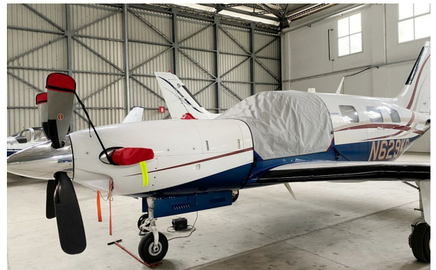
Piper PA-46-500TP Engine Cowling Top Plug