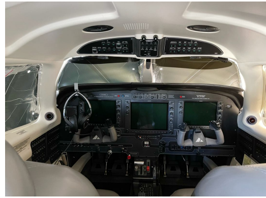
Piper PA46-500TP Cockpit Heatshields