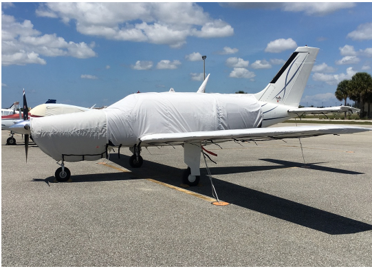
Piper Malibu Extended Canopy Cover, Engine, Wing & Horiz. Stab. Covers