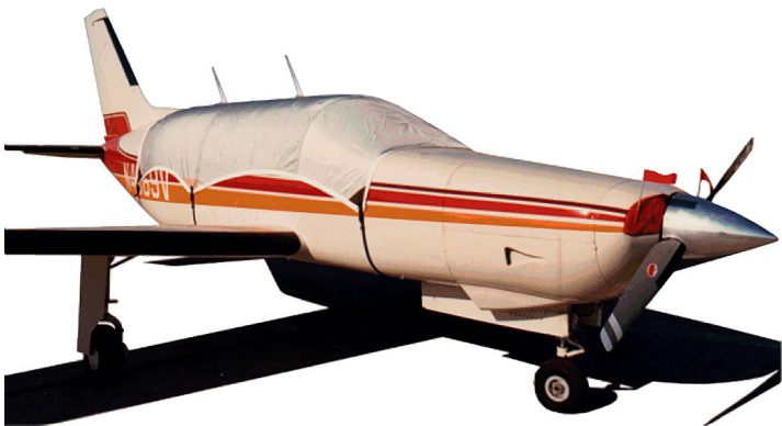
Piper Malibu/Mirage Standard Canopy Cover