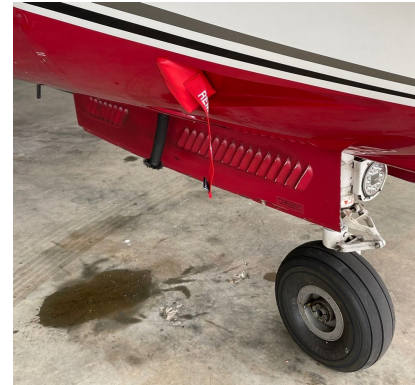
Piper Malibu JetProp Inlet Plug