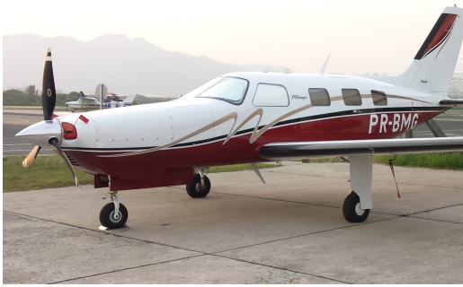
Piper Malibu/Mirage Engine Plugs, Cockpit HeatShields