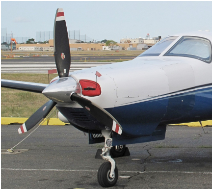
Piper Mirage Engine Plugs

Engine Inlet Plugs are custom fit for your Piper PA-46-350P Mirage, Matrix, JetProp intakes, made with heavy-duty vinyl material, and stuffed with a single block of sculpted urethane foam. Each plug has a zipper that allows the foam to be removed and dried if necessary. Engine plugs have warning flags that are visible from the cockpit or 'remove before flight' streamers sewn onto the face of the plugs. Most plugs are imprinted with the aircraft registration number in black for an extra charge. Storage bag NOT included. Engine plugs may be inserted after flight when the engine is still warm. Engine Inlet Plugs are commonly referred to as Cowl Plugs, Intake Plugs, Cowl Blocks, Engine Blocks, and Engine Bungs.