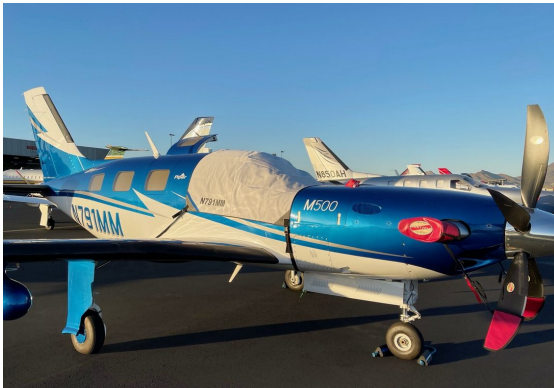
Piper M500 Cockpit Cover

Travel Covers are made with Silver Solution-Dyed Polyester fabric and only lined over the windshield to save weight. The material is lightweight and more compact for easy stowage in the aircraft. The polyester material is water resistant, but only intended for occasional use outside. We also have an ultra lightweight material available for fitted hangar dust covers. For daily outdoor use, the non-travel Sunbrella Cover is the best choice.