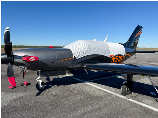
PA-46-600TP Canopy Cover

This cover type is made from Silver Acrylic Sunbrella canvas and is 100% lined with a soft and smooth microfiber. Bruce's Custom Covers developed this material combination especially for aircraft protection. The outer material is medium weight and treated for water resistance, UV resistance and anti-static buildup. The inner lining is a very soft and smooth microfiber to prevent scratching. The material is very reflective, and tests show that the cabin interior temperature can be reduced to near-ambient temperature on the hottest of days. It is water, ice and snow repellent, yet breathable to allow moisture to escape from between the cover and the aircraft surface.