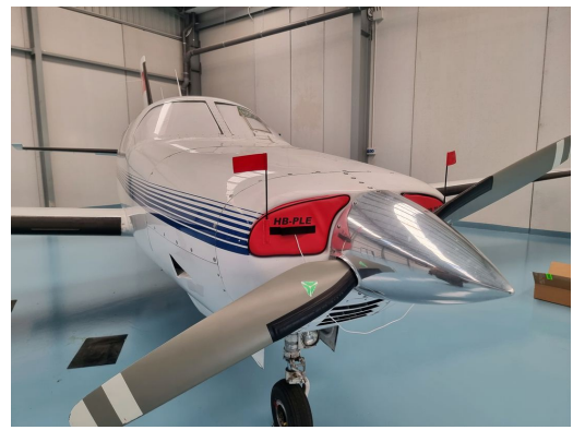
Piper PA-46 Malibu Engine Inlet Plugs