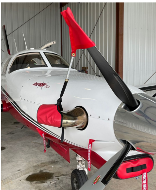
Piper Malibu JetProp Plugs, Prop Tie, Exhaust Covers