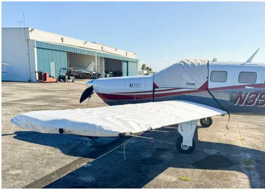
Piper PA 46-350P Cockpit & Wing Covers