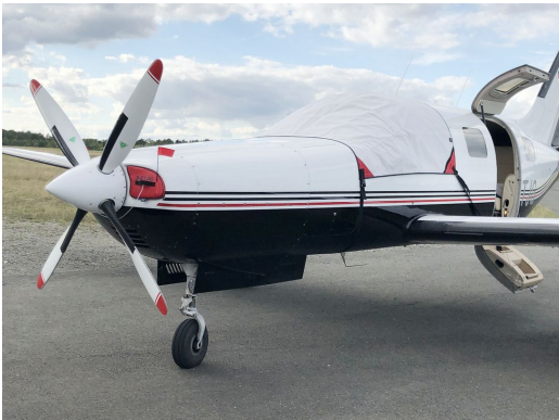
Piper PA-46-50P Malibu Mirage Cockpit Cover