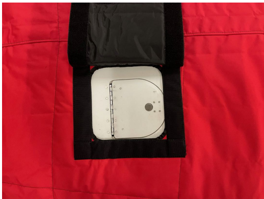
Malibu PA-46-310P Insulated Engine Cover, Oil Door Access

This cover type is made from Silver Acrylic Sunbrella canvas and is 100% lined with a soft and smooth microfiber. Bruce's Custom Covers developed this material combination especially for aircraft protection. The outer material is medium weight and treated for water resistance, UV resistance and anti-static buildup. The inner lining is a very soft and smooth microfiber to prevent scratching. The material is very reflective, and tests show that the cabin interior temperature can be reduced to near-ambient temperature on the hottest of days. It is water, ice and snow repellent, yet breathable to allow moisture to escape from between the cover and the aircraft surface.