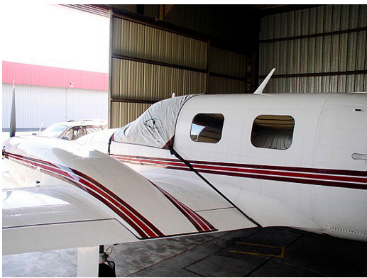
Piper Cheyenne Cockpit Cover