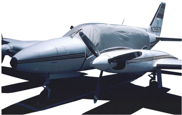
Piper Navajo Canopy Cover

This cover type is made from Silver Acrylic Sunbrella canvas and is 100% lined with a soft and smooth microfiber. Bruce's Custom Covers developed this material combination especially for aircraft protection. The outer material is medium weight and treated for water resistance, UV resistance and anti-static buildup. The inner lining is a very soft and smooth microfiber to prevent scratching. The material is very reflective, and tests show that the cabin interior temperature can be reduced to near-ambient temperature on the hottest of days. It is water, ice and snow repellent, yet breathable to allow moisture to escape from between the cover and the aircraft surface.