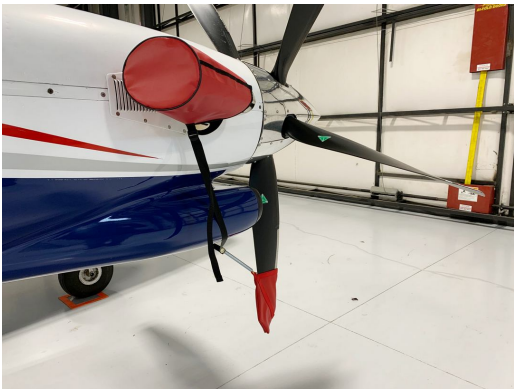
Piper PA-31T Cheyenne II Prop Tie-Downs/Exhaust Covers