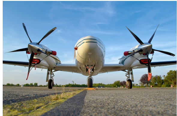
Piper Cheyenne Intake Plugs, Exhaust Covers, Prop Ties