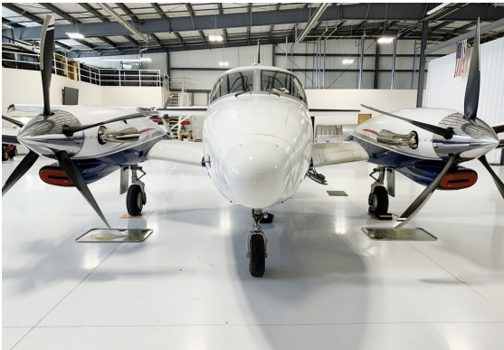
Piper Cheyenne Engine Inlet Plugs

Engine Inlet Plugs are custom fit for your Piper PA-31T: Cheyenne, Cheyenne II XL intakes, made with heavy-duty vinyl material, and stuffed with a single block of sculpted urethane foam. Each plug has a zipper that allows the foam to be removed and dried if necessary. Engine plugs have warning flags that are visible from the cockpit or 'remove before flight' streamers sewn onto the face of the plugs. Most plugs are imprinted with the aircraft registration number in black for an extra charge. Storage bag NOT included. Engine plugs may be inserted after flight when the engine is still warm. Engine Inlet Plugs are commonly referred to as Cowl Plugs, Intake Plugs, Cowl Blocks, Engine Blocks, and Engine Bungs.