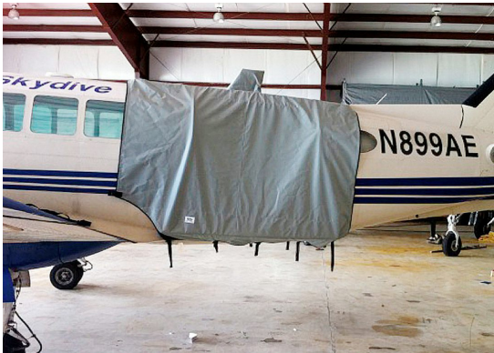
750XL Jump Door Cover