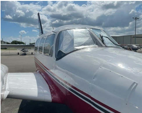
Piper PA-31 Models Cockpit HeatShields

Heatshields are interior sunshades for an aircraft's windows or canopy glass. The product is a unique composite of closed-cell foam with a silver mylar finish. The semi-rigid design is stiff enough to stand along the inside of the windshield using sun visors or window framing. It folds up flat and easily stores in the included storage sleeve. Some designs may require velcro and suction cups. A Heatshield is an excellent short-term remedy for cockpit overheating.