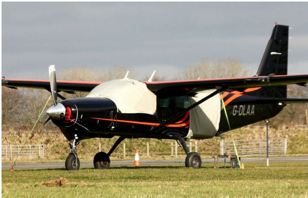
Cessna Caravan Cockpit Cover, Engine Plugs, Jump Door Cover