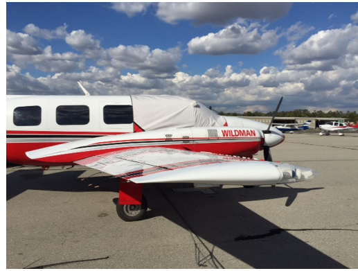
Piper Navajo Cockpit Cover, extended to cover emerg. door.