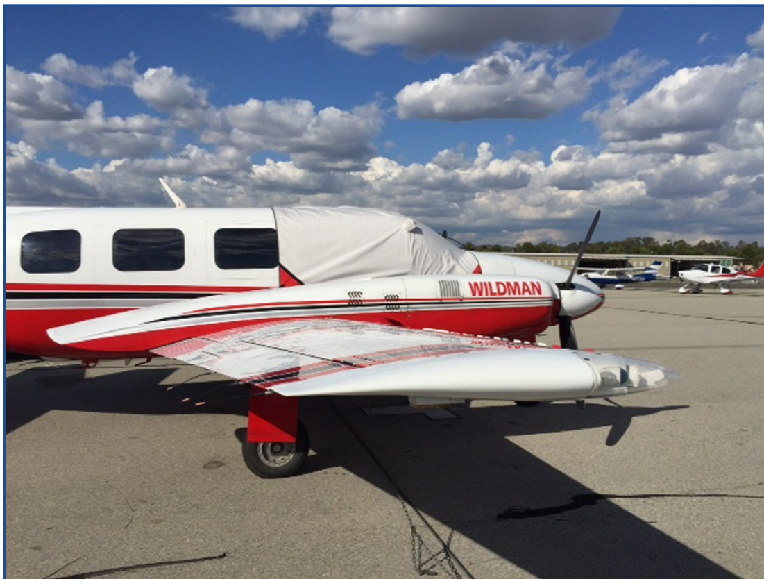
Piper Navajo Cockpit Cover, extended to cover emerg. door.