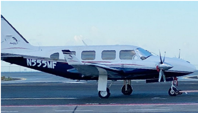
Piper Navajo Cockpit & Cabin HeatShields