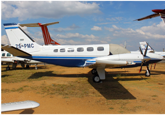
Cessna 441 Conquest II Cockpit Cover