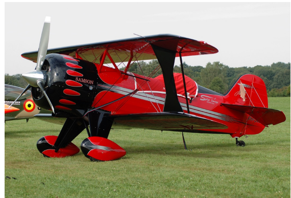
Pitts Samson II Canopy Cover