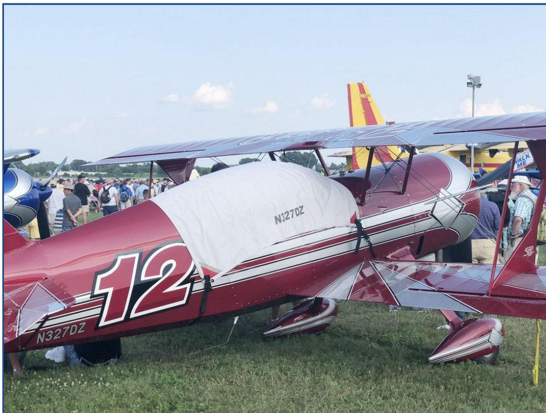
Pitts Model 12 Canopy Cover