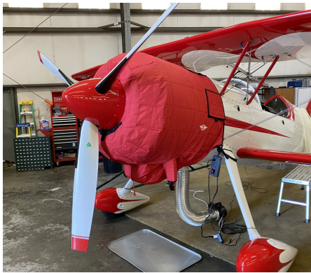
Pitts Model 12 Insulated Engine Cover

the hottest of days. It is water, ice and snow repellent, yet breathable to allow moisture to escape from between the cover and the aircraft surface.