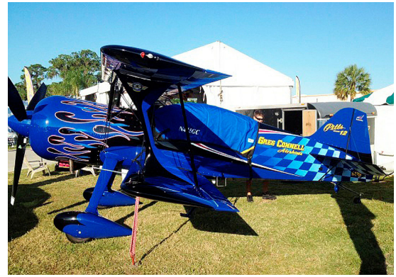
Pitts Model 12 Canopy Cover