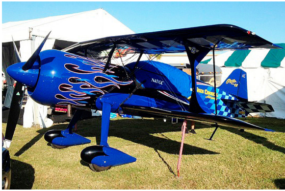
Pitts Model 12 Canopy Cover