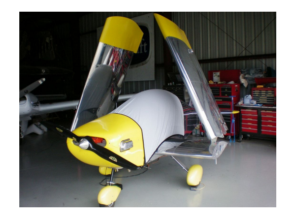
Onex Flyaway Cover