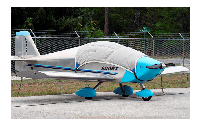
Sonex Canopy Cover