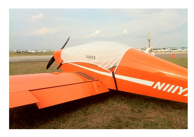
Sonex Canopy Cover