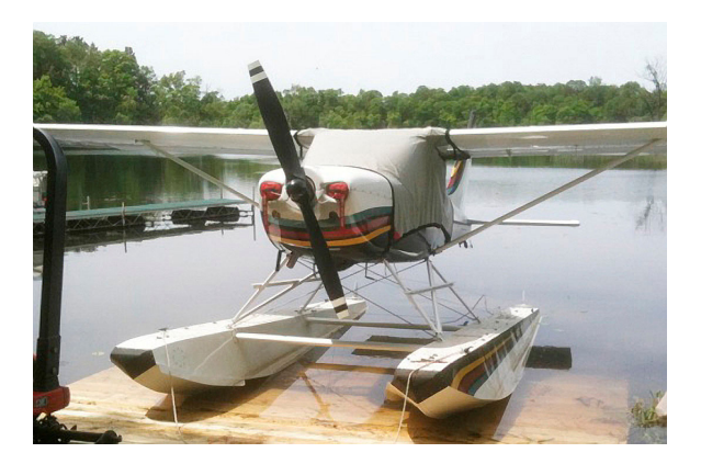
Glastar Sportsman Canopy Cover and Engine Plugs