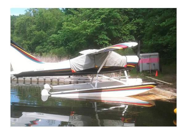
Glastar Over-Top Canopy Cover