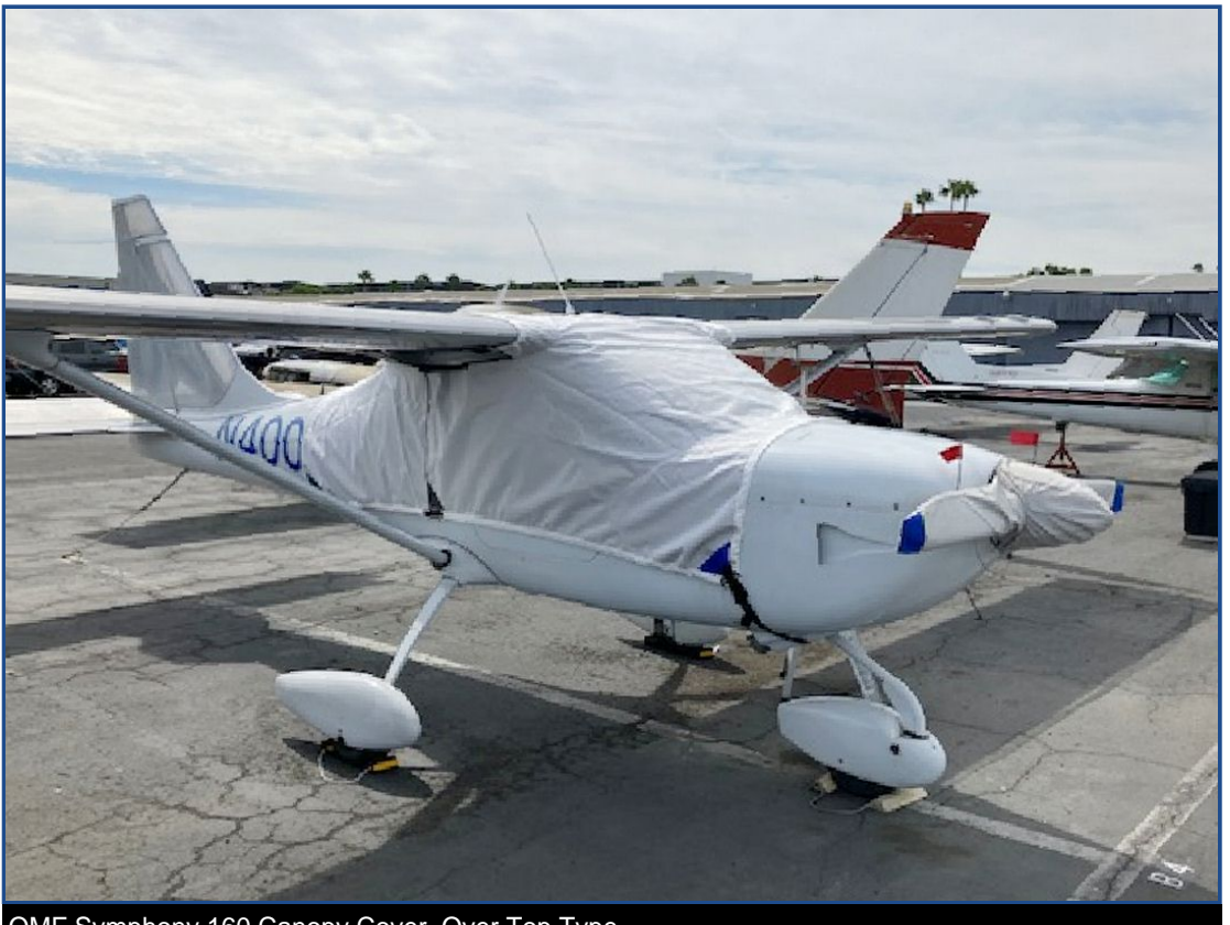
OMF Symphony 160 Canopy Cover, Over Top Type