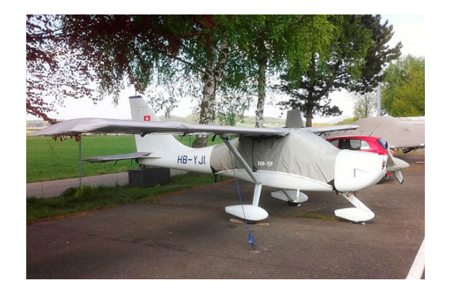
Glasair Aviation Glastar, Sportsman 2+2 Canopy Cover (Over-The-Top Style)