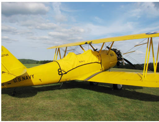
N3N Canopy Cover