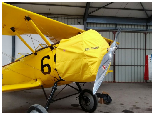
N3N Engine Cover

This cover type is made from Silver Acrylic Sunbrella canvas and is 100% lined with a soft and smooth microfiber. Bruce's Custom Covers developed this material combination especially for aircraft protection. The outer material is medium weight and treated for water resistance, UV resistance and anti-static buildup. The inner lining is a very soft and smooth microfiber to prevent scratching. The material is very reflective, and tests show that the cabin interior temperature can be reduced to near-ambient temperature on the hottest of days. It is water, ice and snow repellent, yet breathable to allow moisture to escape from between the cover and the aircraft surface.