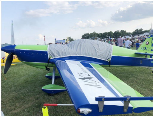
MX2 Lightweight Travel Canopy Cover