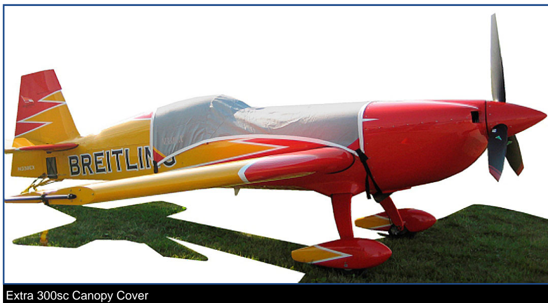
Extra 300sc Canopy Cover