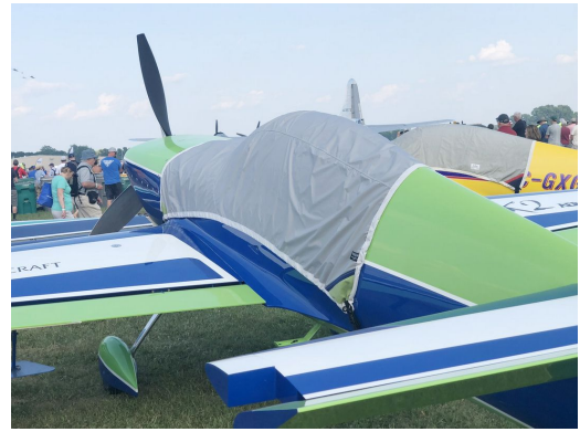
MX2 Lightweight Travel Canopy Cover