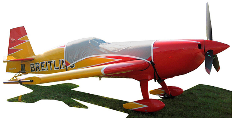
Extra 300sc Canopy Cover