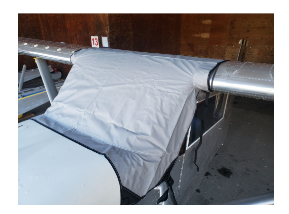
Cessna 180 Canopy Cover