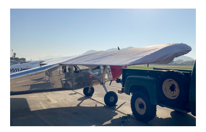
Murphy Elite Wing Covers, test fit cover

WINTER USE MATERIAL - Made with Solution-Dyed Polyester fabric, this option is intended for seasonal use to aid in deicing, rain mitigation, or for occasional travel. The material is lighter and more compact, but more susceptible to UV damage and may have a shorter useful life if used continuously outside than the all-year use material.