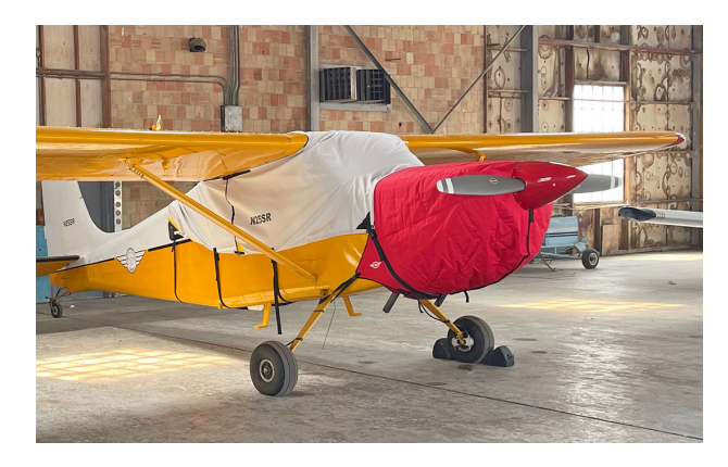
Murphy Super Rebel Insulated Engine Cover

This cover type is made from Silver Acrylic Sunbrella canvas and is 100% lined with a soft and smooth microfiber. Bruce's Custom Covers developed this material combination especially for aircraft protection. The outer material is medium weight and treated for water resistance, UV resistance and anti-static buildup. The inner lining is a very soft and smooth microfiber to prevent scratching. The material is very reflective, and tests show that the cabin interior temperature can be reduced to near-ambient temperature on the hottest of days. It is water, ice and snow repellent, yet breathable to allow moisture to escape from between the cover and the aircraft surface.