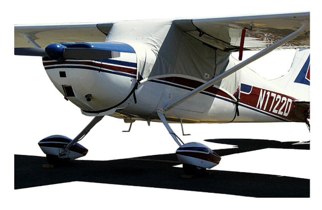
Over-the-Top Canopy Cover

Covers developed this material combination especially for aircraft protection. The outer material is medium weight and treated for water resistance, UV resistance and anti-static buildup. The inner lining is a very soft and smooth microfiber to prevent scratching. The material is very reflective, and tests show that the cabin interior temperature can be reduced to near-ambient temperature on the hottest of days. It is water, ice and snow repellent, yet breathable to allow moisture to escape from between the cover and the aircraft surface.