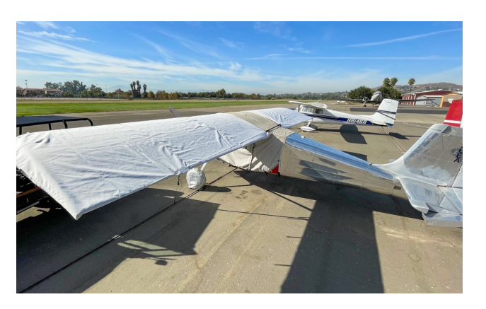
Murphy Elite Wing Covers