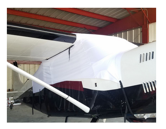
Murphy Moose Canopy Cover (test fit cover)