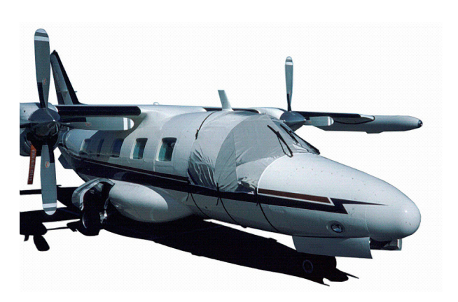
MU-2 Windshield Cover & Engine Plugs