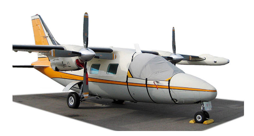
MU-2 Windshield Cover & Engine Plugs