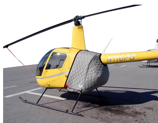
Robinson R-22 Insulated Engine Cover (also covers bottom) & Front Blade Tie-down