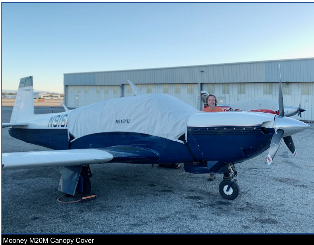
Mooney M20M Canopy Cover