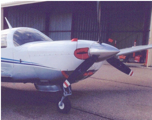
Mooney M20M TLS Engine Plugs

Engine Inlet Plugs are custom fit for your Mooney TLS, Bravo, Acclaim TN, Type S, & Porsche Powered Models intakes, made with heavy-duty vinyl material, and stuffed with a single block of sculpted urethane foam. Each plug has a zipper that allows the foam to be removed and dried if necessary. Engine plugs have warning flags that are visible from the cockpit or 'remove before flight' streamers sewn onto the face of the plugs. Most plugs are imprinted with the aircraft registration number in black for an extra charge. Storage bag NOT included. Engine plugs may be inserted after flight when the engine is still warm. Engine Inlet Plugs are commonly referred to as Cowl Plugs, Intake Plugs, Cowl Blocks, Engine Blocks, and Engine Bungs.