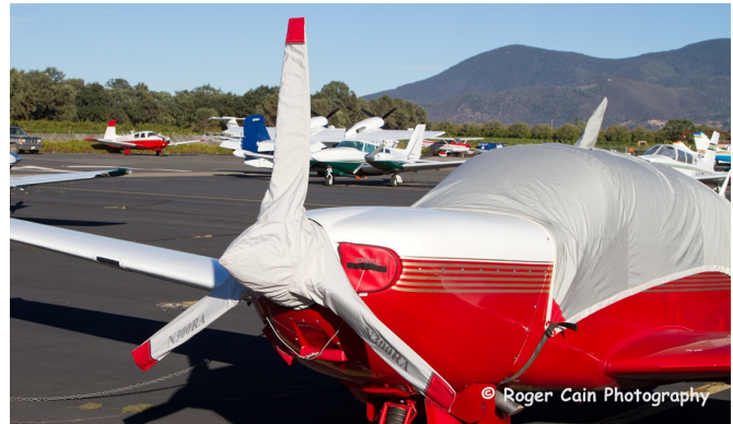
Mooney M20M Bravo 3-Blade Prop Cover, Engine Plugs