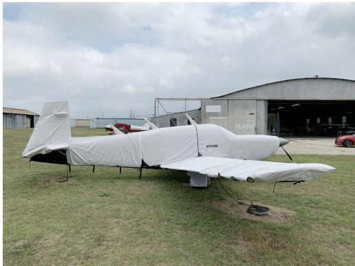
Mooney M20M Bravo Cover Set