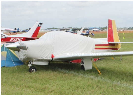
Mooney M20C Extended Canopy/Engine Cover

This cover type is made from Silver Acrylic Sunbrella canvas and is 100% lined with a soft and smooth microfiber. Bruce's Custom Covers developed this material combination especially for aircraft protection. The outer material is medium weight and treated for water resistance, UV resistance and anti-static buildup. The inner lining is a very soft and smooth microfiber to prevent scratching. The material is very reflective, and tests show that the cabin interior temperature can be reduced to near-ambient temperature on the hottest of days. It is water, ice and snow repellent, yet breathable to allow moisture to escape from between the cover and the aircraft surface.