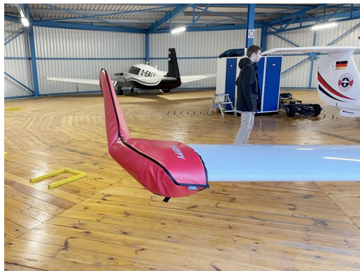
Diamond DA-40 Wingtip Pads

Designed to prevent damage to the aircraft extremities in crowded hangars, these products are made of bright red Naugahyde and thickly padded with a sandwich of closed cell foam.