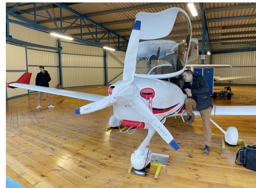
DA40 NG Engine Plugs