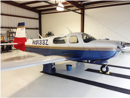
Mooney Tailcone Cover