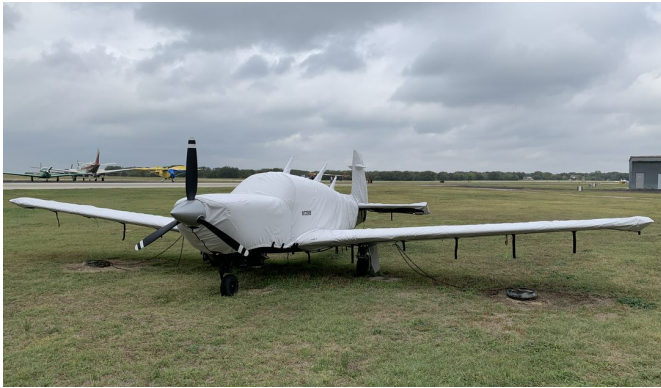
Mooney M20M Bravo Cover Set

WINTER USE MATERIAL - Made with Solution-Dyed Polyester fabric, this option is intended for seasonal use to aid in deicing, rain mitigation, or for occasional travel. The material is lighter and more compact, but more susceptible to UV damage and may have a shorter useful life if used continuously outside than the all-year use material.