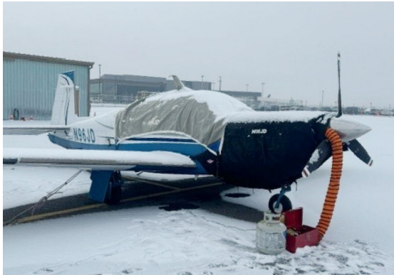
Mooney Bravo Insulated Engine Cover, Fully Enclosed