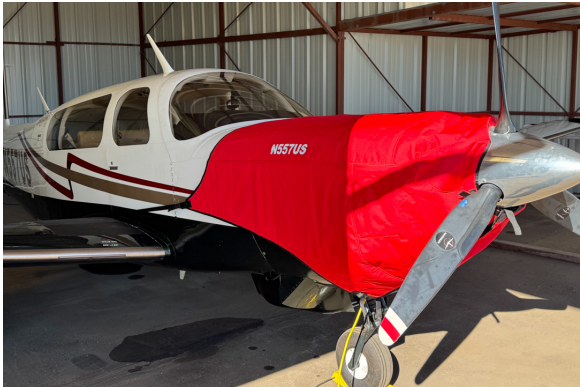
Mooney M20M, Insulated Engine Cover, doesn't cover gear well

This cover type is made from Silver Acrylic Sunbrella canvas and is 100% lined with a soft and smooth microfiber. Bruce's Custom Covers developed this material combination especially for aircraft protection. The outer material is medium weight and treated for water resistance, UV resistance and anti-static buildup. The inner lining is a very soft and smooth microfiber to prevent scratching. The material is very reflective, and tests show that the cabin interior temperature can be reduced to near-ambient temperature on the hottest of days. It is water, ice and snow repellent, yet breathable to allow moisture to escape from between the cover and the aircraft surface.