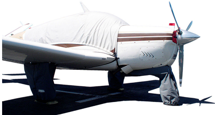
Beech Bonanza/Debonair/Baron Landing Gear Covers