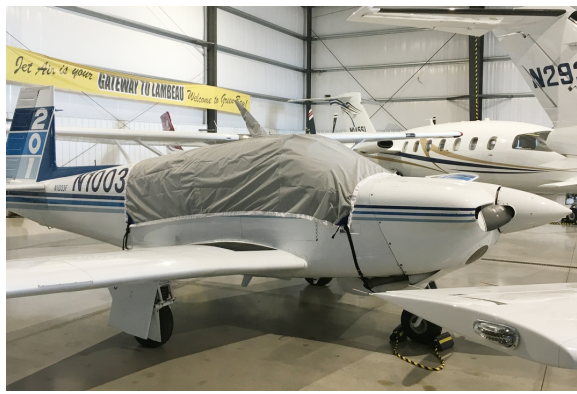
Mooney 201 Travel Cover, Light Weight Travel Canopy Cover, 5 Lbs