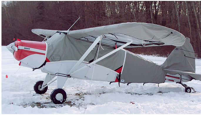
Piper Clipper Canopy Cover, Empennage & Wing Covers, Engine Plugs