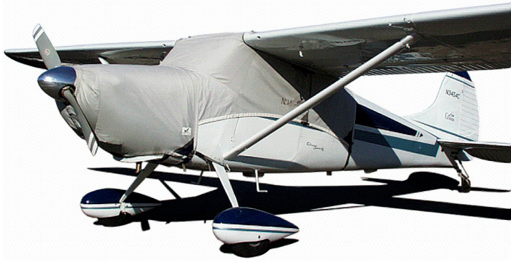
Cessna 170 Canopy Cover & Engine Cover

This cover type is made from Silver Acrylic Sunbrella canvas and is 100% lined with a soft and smooth microfiber. Bruce's Custom Covers developed this material combination especially for aircraft protection. The outer material is medium weight and treated for water resistance, UV resistance and anti-static buildup. The inner lining is a very soft and smooth microfiber to prevent scratching. The material is very reflective, and tests show that the cabin interior temperature can be reduced to near-ambient temperature on the hottest of days. It is water, ice and snow repellent, yet breathable to allow moisture to escape from between the cover and the aircraft surface.