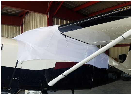
Murphy Moose Canopy Cover (test fit cover)

Covers developed this material combination especially for aircraft protection. The outer material is medium weight and treated for water resistance, UV resistance and anti-static buildup. The inner lining is a very soft and smooth microfiber to prevent scratching. The material is very reflective, and tests show that the cabin interior temperature can be reduced to near-ambient temperature on the hottest of days. It is water, ice and snow repellent, yet breathable to allow moisture to escape from between the cover and the aircraft surface.