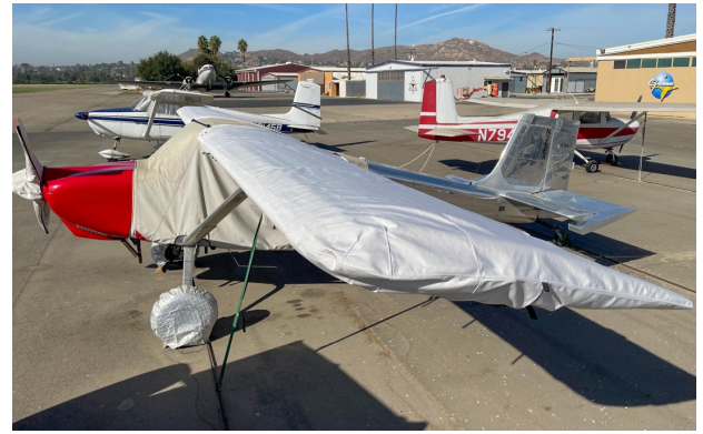
Cessna 185 Canopy, Wings & Empennage Covers, and Engine Plugs