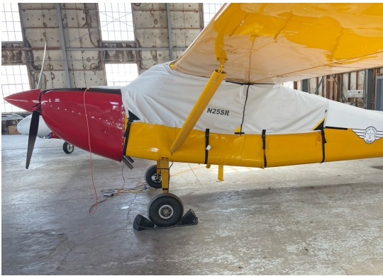
Murphy Super Rebel Canopy Cover