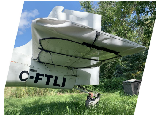
Murphy Elite Horizontal Stabilizer Covers