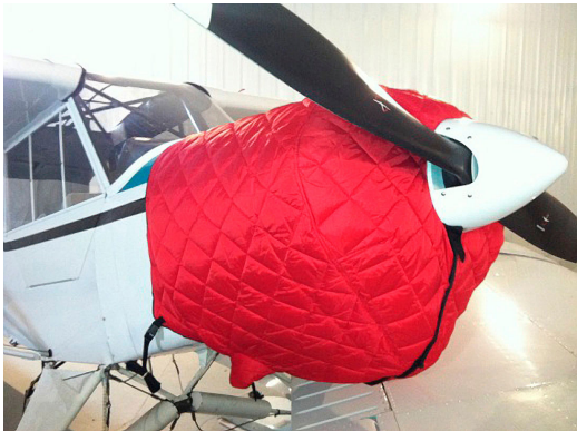
Piper Super Cub Insulated Engine Cover