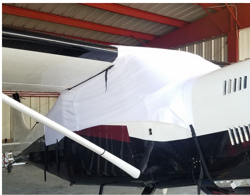
Murphy Moose Canopy Cover (test fit cover)

This cover type is made from Silver Acrylic Sunbrella canvas and is 100% lined with a soft and smooth microfiber. Bruce's Custom Covers developed this material combination especially for aircraft protection. The outer material is medium weight and treated for water resistance, UV resistance and anti-static buildup. The inner lining is a very soft and smooth microfiber to prevent scratching. The material is very reflective, and tests show that the cabin interior temperature can be reduced to near-ambient temperature on the hottest of days. It is water, ice and snow repellent, yet breathable to allow moisture to escape from between the cover and the aircraft surface.