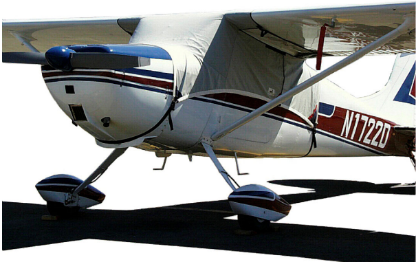
Over-the-Top Canopy Cover