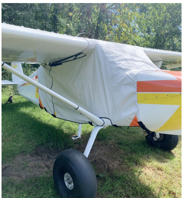
Murphy Elite Over The Top Style Extended Canopy Cover