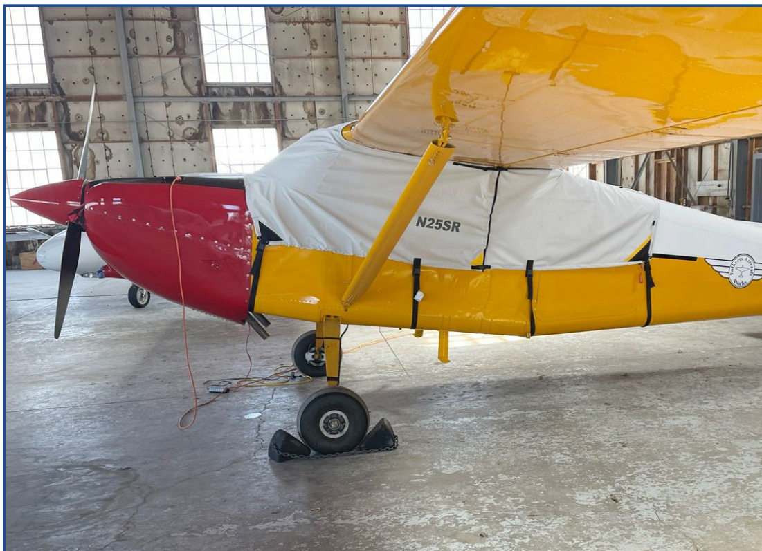
Murphy Super Rebel Canopy Cover