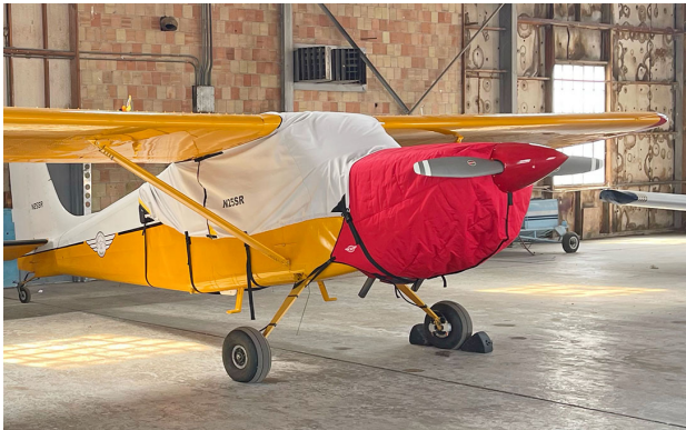
Murphy Super Rebel Insulated Engine Cover

This cover type is made from Silver Acrylic Sunbrella canvas and is 100% lined with a soft and smooth microfiber. Bruce's Custom Covers developed this material combination especially for aircraft protection. The outer material is medium weight and treated for water resistance, UV resistance and anti-static buildup. The inner lining is a very soft and smooth microfiber to prevent scratching. The material is very reflective, and tests show that the cabin interior temperature can be reduced to near-ambient temperature on the hottest of days. It is water, ice and snow repellent, yet breathable to allow moisture to escape from between the cover and the aircraft surface.