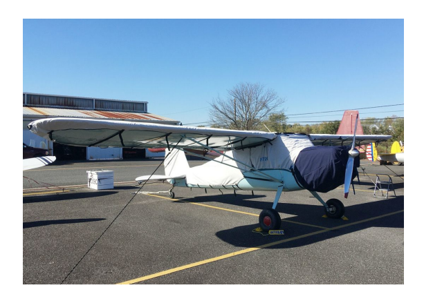
Cessna 140 Canopy, Engine, Wing & Empennage Covers

WINTER USE MATERIAL - Made with Solution-Dyed Polyester fabric, this option is intended for seasonal use to aid in deicing, rain mitigation, or for occasional travel. The material is lighter and more compact, but more susceptible to UV damage and may have a shorter useful life if used continuously outside than the all-year use material.