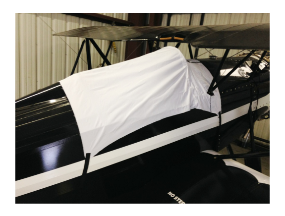
Rose Parrakeet Canopy Cover (test fit cover)