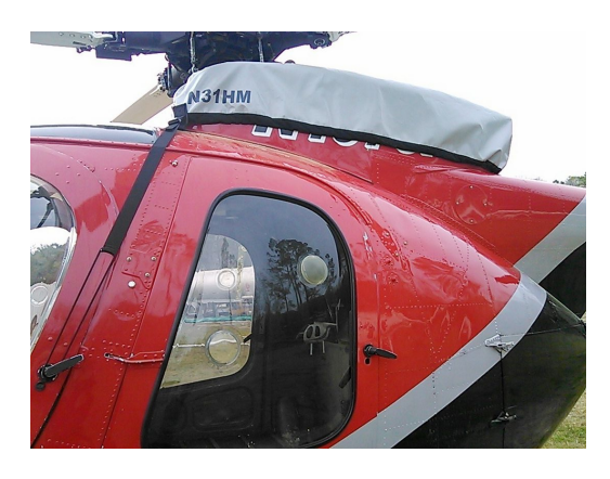
Customized Engine Cover