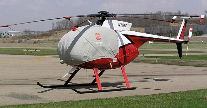
Full Cover Set