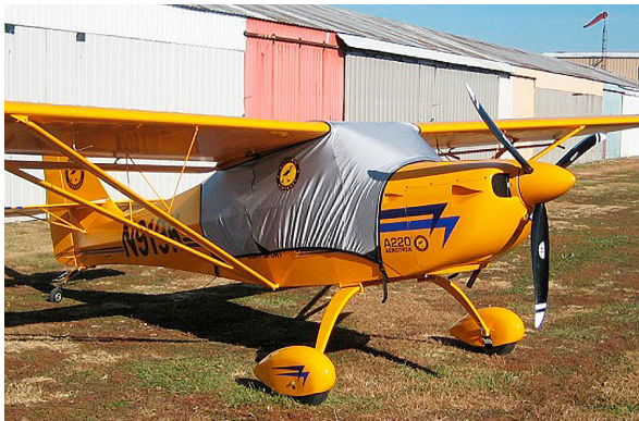
Aerotrek A220 Fitted Hangar Dust Cover