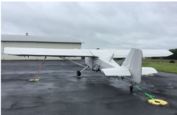
Kitfox 5 Complete Cover Set

This cover type is made from Silver Acrylic Sunbrella canvas and is 100% lined with a soft and smooth microfiber. Bruce's Custom Covers developed this material combination especially for aircraft protection. The outer material is medium weight and treated for water resistance, UV resistance and anti-static buildup. The inner lining is a very soft and smooth microfiber to prevent scratching. The material is very reflective, and tests show that the cabin interior temperature can be reduced to near-ambient temperature on the hottest of days. It is water, ice and snow repellent, yet breathable to allow moisture to escape from between the cover and the aircraft surface.