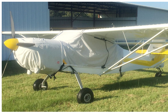
Kitfox Canopy & Engine Cover