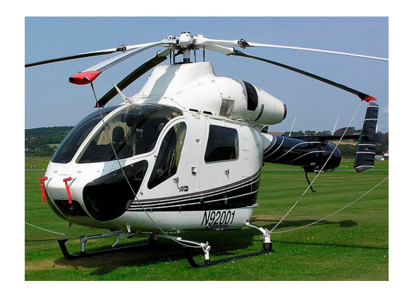
MD900 Blade Tie-downs and Pitot Cover Set