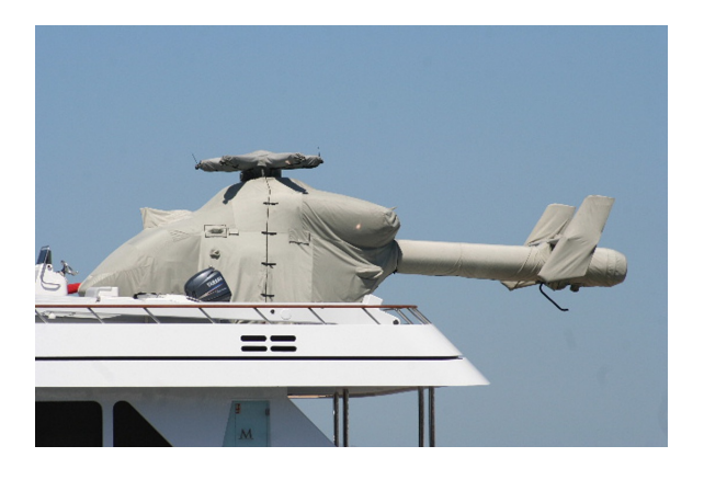
MD900 Complete Cover Set