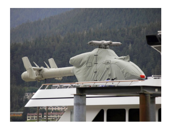
MD900 Full Cover Set

The Tailboom Cover details vary by model, but generally the helicopter tail boom cover encloses the tail boom from the "bottleneck" to the aft end. They usually also cover the horizontal stabilizers, and are custom made to allow for antennae, lights, and other protrusions. They attach with straps underneath the tail boom. Covers for the vertical and horizontal stabilizers are also available separately. Specific information for each model is available on request.