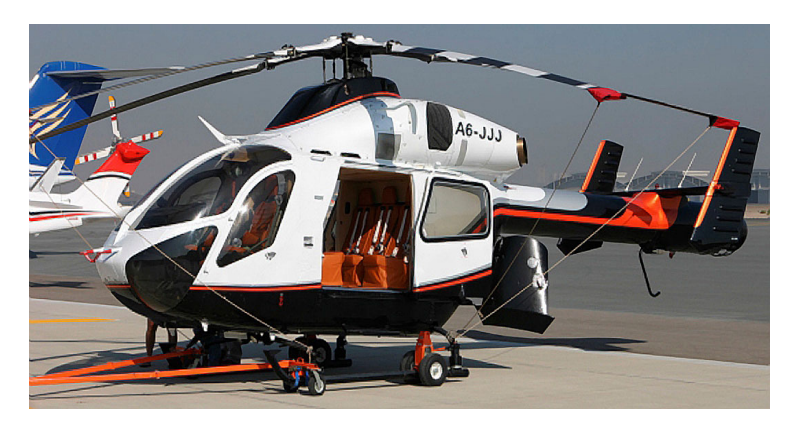
MD900 Blade Tie-downs and Pitot Cover Set