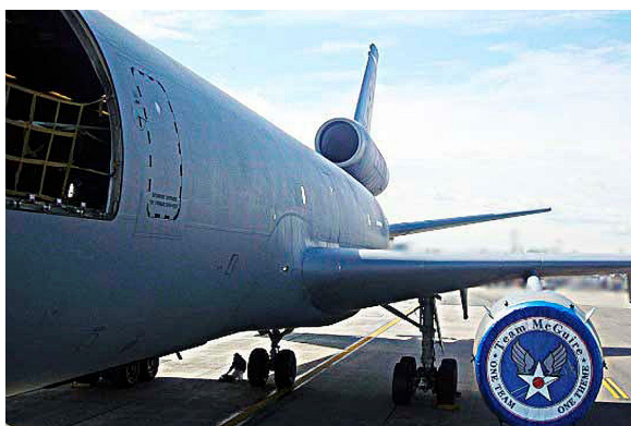
KC-10 Intake Cover at McGuire AFB, NJ