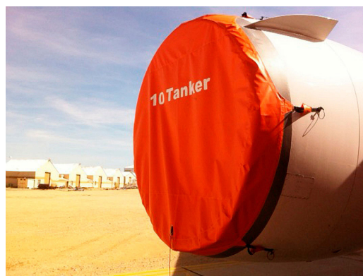
DC-10-30 Intake Cover (CF650C2 Engine)