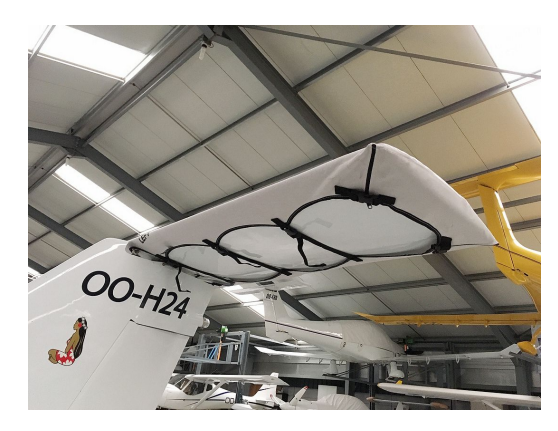
Dynaero MCR Horizontal Stabilizer Cover

WINTER USE MATERIAL - Made with Solution-Dyed Polyester fabric, this option is intended for seasonal use to aid in deicing, rain mitigation, or for occasional travel. The material is lighter and more compact, but more susceptible to UV damage and may have a shorter useful life if used continuously outside than the all-year use material.