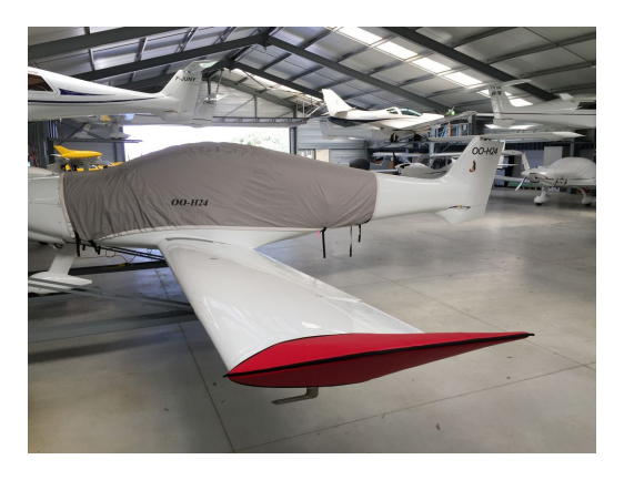
Dynaero MCR.4 Pickup Canopy Cover, Wingtip Pads