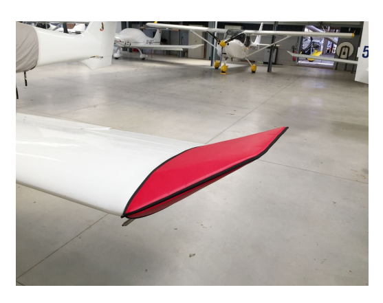
Dynaero MCR Pickup Wingtip Pads

Dynaero MCR.4 Pickup Canopy Cover, Wingtip Pads