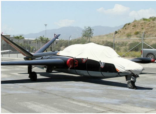
Fouga Magister Canopy/Nose Cover with nose mount loop antenna