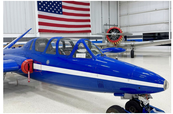
Fouga Magister CM170 Intake Plugs