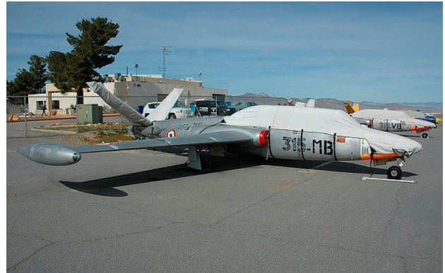
Fouga Magister Canopy/Nose Cover & Tail Stabilizer Covers