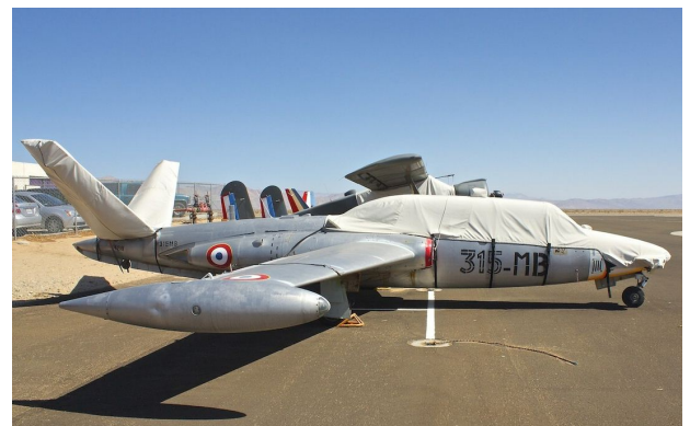
Fouga Magister Canopy/Nose Cover, Tail Stabilizer Covers