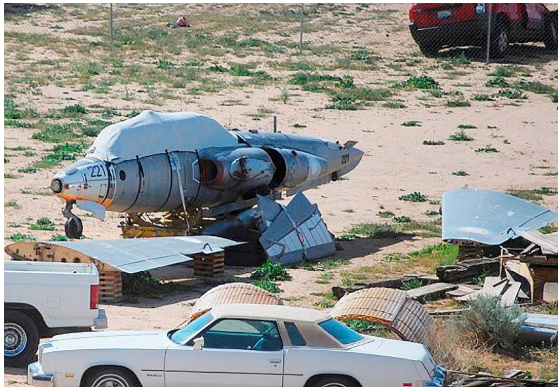
Fouga Magister Canopy Cover