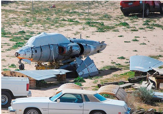
Fouga Magister Canopy Cover

Travel Covers are made with Silver Solution-Dyed Polyester fabric and only lined over the windshield to save weight. The material is lightweight and more compact for easy stowage in the aircraft. The polyester material is water resistant, but only intended for occasional use outside. We also have an ultra lightweight material available for fitted hangar dust covers. For daily outdoor use, the non-travel Sunbrella Cover is the best choice.