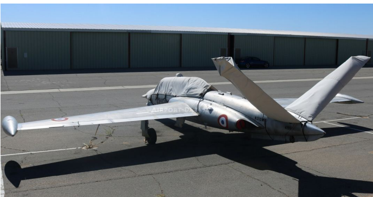
Fouga Magister Canopy/Nose Cover, Tail Stabilizer Covers

WINTER USE MATERIAL - Made with Solution-Dyed Polyester fabric, this option is intended for seasonal use to aid in deicing, rain mitigation, or for occasional travel. The material is lighter and more compact, but more susceptible to UV damage and may have a shorter useful life if used continuously outside than the all-year use material.