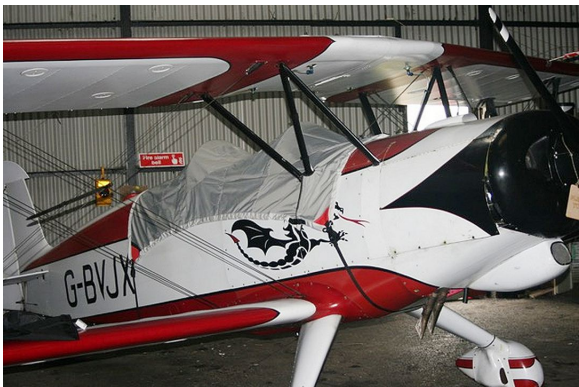
Marquardt Charger MA-5 Light Weight Travel Cockpit Cover

This cover type is made from Silver Acrylic Sunbrella canvas and is 100% lined with a soft and smooth microfiber. Bruce's Custom Covers developed this material combination especially for aircraft protection. The outer material is medium weight and treated for water resistance, UV resistance and anti-static buildup. The inner lining is a very soft and smooth microfiber to prevent scratching. The material is very reflective, and tests show that the cabin interior temperature can be reduced to near-ambient temperature on the hottest of days. It is water, ice and snow repellent, yet breathable to allow moisture to escape from between the cover and the aircraft surface.