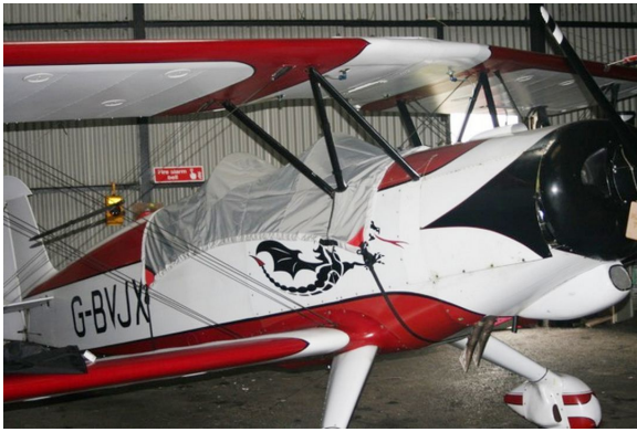
Marquardt Charger MA-5 Canopy Cover