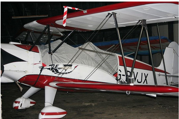
Marquardt Charger MA-5 Light Weight Travel Cockpit Cover