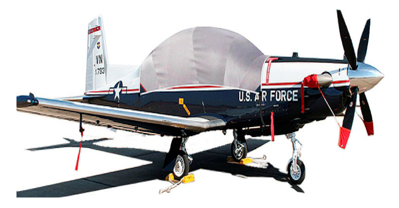
Pilatus P-3 Canopy Cover