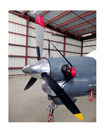
Embraer EMB 312 Tucano Prop Tie Down/Exhaust Covers