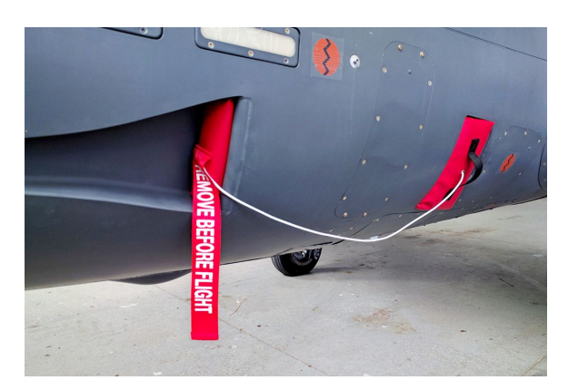
Embraer EMB 312 Tucano Side Naca Plugs