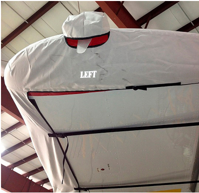
De Havilland Twin Otter Wing Cover wing tip detail

WINTER USE MATERIAL - Made with Solution-Dyed Polyester fabric, this option is intended for seasonal use to aid in deicing, rain mitigation, or for occasional travel. The material is lighter and more compact, but more susceptible to UV damage and may have a shorter useful life if used continuously outside than the all-year use material.