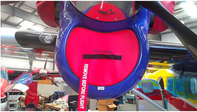
De Havilland Twin Otter Engine Inlet Plug and Exhaust Covers