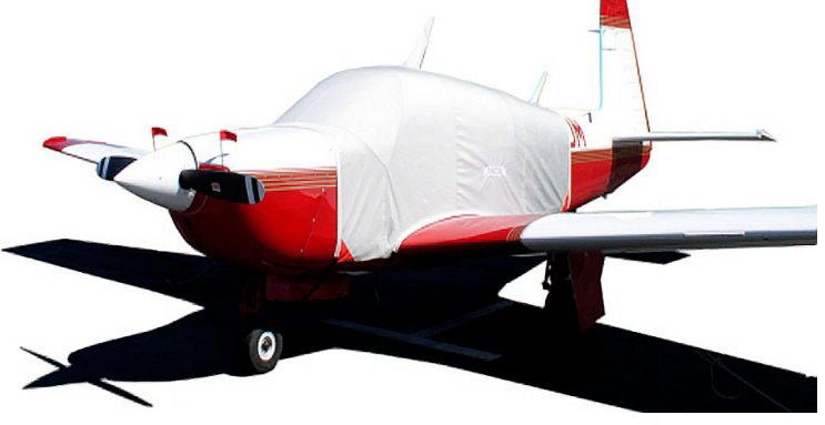
Covers for the Mooney Mustang