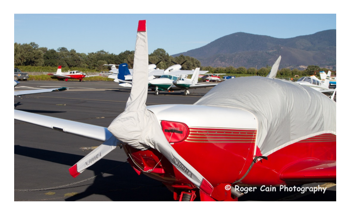
Mooney M20M Bravo 3-Blade Prop Cover, Engine Plugs