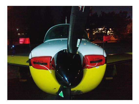
Mooney 231 Engine Inlet Plugs

Engine Inlet Plugs are custom fit for your Mooney M20V Acclaim Ultra intakes, made with heavy-duty vinyl material, and stuffed with a single block of sculpted urethane foam. Each plug has a zipper that allows the foam to be removed and dried if necessary. Engine plugs have warning flags that are visible from the cockpit or 'remove before flight' streamers sewn onto the face of the plugs. Most plugs are imprinted with the aircraft registration number in black for an extra charge. Storage bag NOT included. Engine plugs may be inserted after flight when the engine is still warm. Engine Inlet Plugs are commonly referred to as Cowl Plugs, Intake Plugs, Cowl Blocks, Engine Blocks, and Engine Bungs.