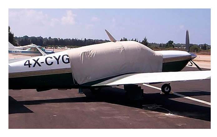
Mooney M20 Extended Canopy Cover