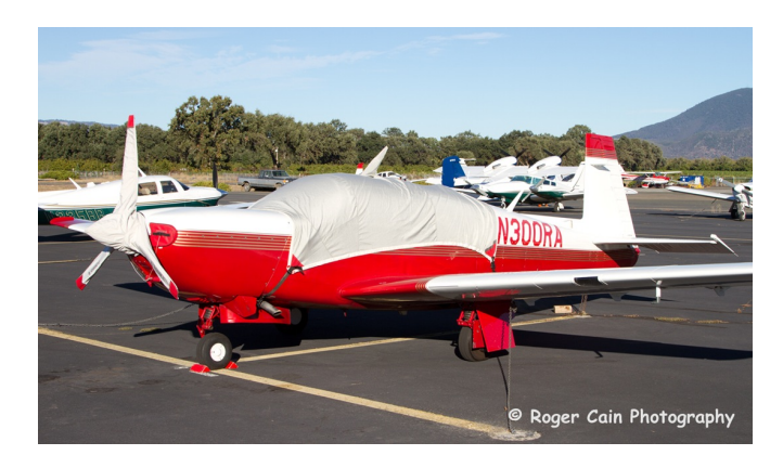
Mooney M20M Bravo Canopy Cover, 3-Blade Prop Cover

This cover type is made from Silver Acrylic Sunbrella canvas and is 100% lined with a soft and smooth microfiber. Bruce's Custom Covers developed this material combination especially for aircraft protection. The outer material is medium weight and treated for water resistance, UV resistance and anti-static buildup. The inner lining is a very soft and smooth microfiber to prevent scratching. The material is very reflective, and tests show that the cabin interior temperature can be reduced to near-ambient temperature on the hottest of days. It is water, ice and snow repellent, yet breathable to allow moisture to escape from between the cover and the aircraft surface.