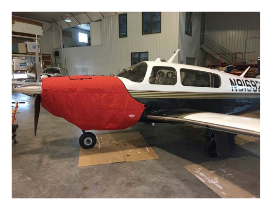
Mooney Ovation Insulated Engine Cover

Mooney 201 Insulated Engine Cover, fully enclosed