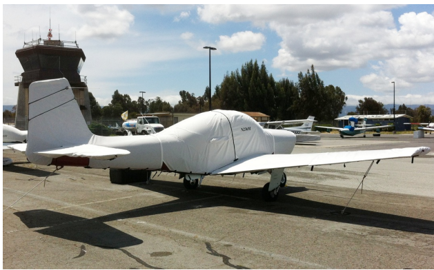
Meyers 200 Complete Cover Set