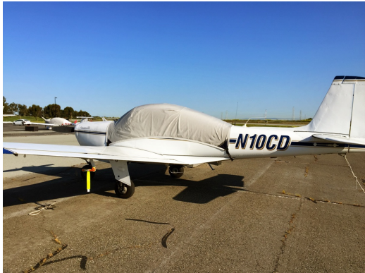
Meyer (Aero Commander) 200 Canopy Cover

This cover type is made from Silver Acrylic Sunbrella canvas and is 100% lined with a soft and smooth microfiber. Bruce's Custom Covers developed this material combination especially for aircraft protection. The outer material is medium weight and treated for water resistance, UV resistance and anti-static buildup. The inner lining is a very soft and smooth microfiber to prevent scratching. The material is very reflective, and tests show that the cabin interior temperature can be reduced to near-ambient temperature on the hottest of days. It is water, ice and snow repellent, yet breathable to allow moisture to escape from between the cover and the aircraft surface.