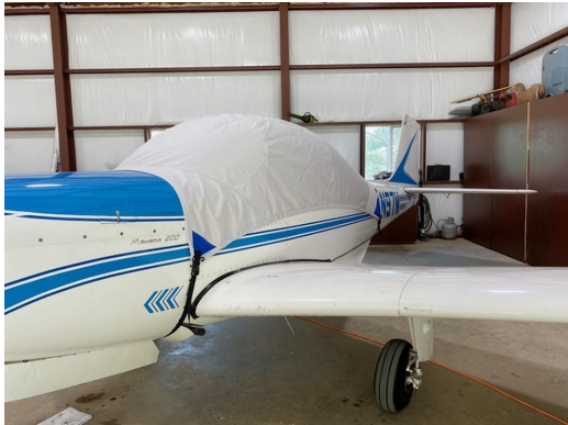
Meyers (Rockwell) 200 Canopy Cover