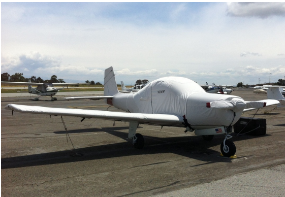
Meyers 200 Complete Cover Set

This cover type is made from Silver Acrylic Sunbrella canvas and is 100% lined with a soft and smooth microfiber. Bruce's Custom Covers developed this material combination especially for aircraft protection. The outer material is medium weight and treated for water resistance, UV resistance and anti-static buildup. The inner lining is a very soft and smooth microfiber to prevent scratching. The material is very reflective, and tests show that the cabin interior temperature can be reduced to near-ambient temperature on the hottest of days. It is water, ice and snow repellent, yet breathable to allow moisture to escape from between the cover and the aircraft surface.