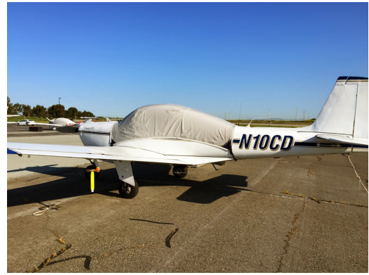
Meyer (Aero Commander) 200 Canopy Cover