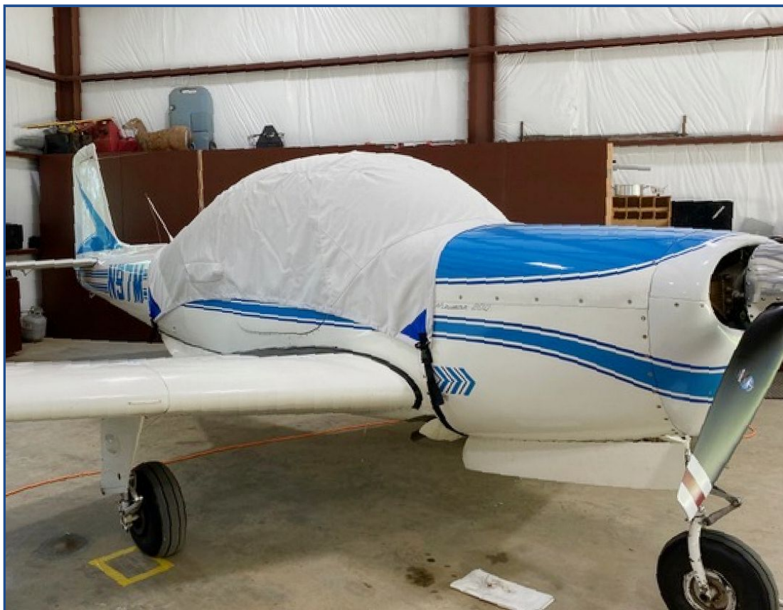
Meyers (Rockwell) 200 Canopy Cover