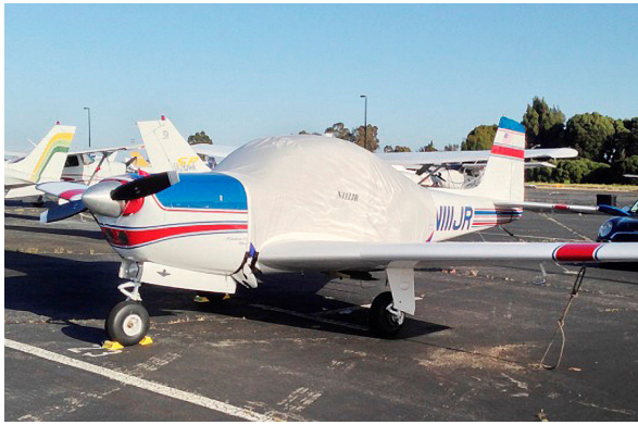
Meyers 200 Extended Canopy Cover & Engine Plugs