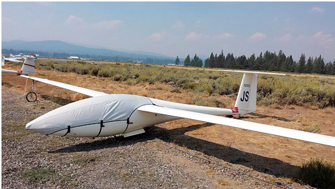
ASW-20C Canopy/Nose Cover