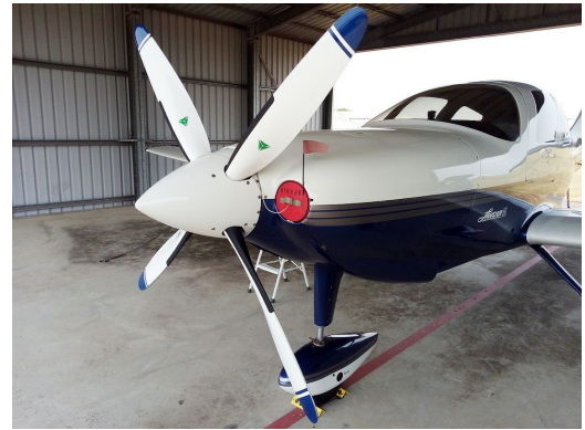
Lancair ES Engine Plugs