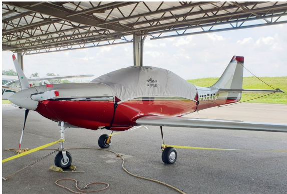
Lancair VI-P Canopy Cover & Engine Plugs