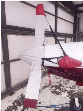
Lancair IV Prop Cover

This cover type is made from Silver Acrylic Sunbrella canvas and is 100% lined with a soft and smooth microfiber. Bruce's Custom Covers developed this material combination especially for aircraft protection. The outer material is medium weight and treated for water resistance, UV resistance and anti-static buildup. The inner lining is a very soft and smooth microfiber to prevent scratching. The material is very reflective, and tests show that the cabin interior temperature can be reduced to near-ambient temperature on the hottest of days. It is water, ice and snow repellent, yet breathable to allow moisture to escape from between the cover and the aircraft surface.