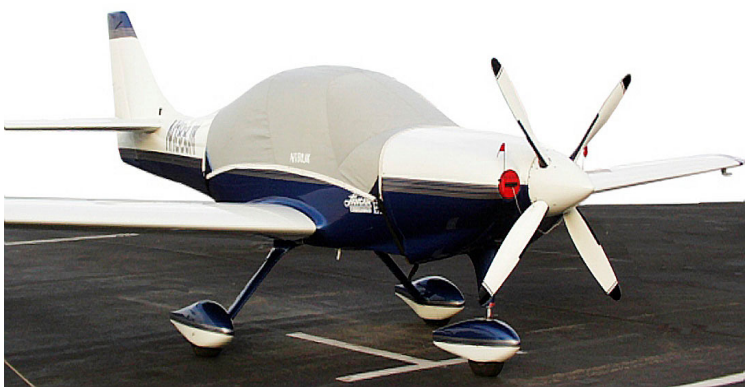
Lancair ES Canopy Cover

This cover type is made from Silver Acrylic Sunbrella canvas and is 100% lined with a soft and smooth microfiber. Bruce's Custom Covers developed this material combination especially for aircraft protection. The outer material is medium weight and treated for water resistance, UV resistance and anti-static buildup. The inner lining is a very soft and smooth microfiber to prevent scratching. The material is very reflective, and tests show that the cabin interior temperature can be reduced to near-ambient temperature on the hottest of days. It is water, ice and snow repellent, yet breathable to allow moisture to escape from between the cover and the aircraft surface.