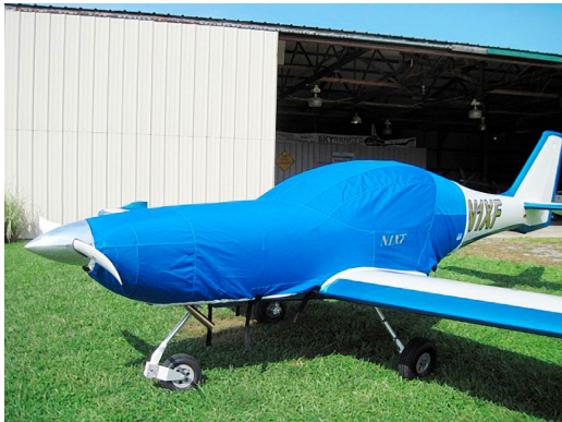
Arion Lightning Extended Canopy/Engine Cover

Travel Covers are made with Silver Solution-Dyed Polyester fabric and only lined over the windshield to save weight. The material is lightweight and more compact for easy stowage in the aircraft. The polyester material is water resistant, but only intended for occasional use outside. We also have an ultra lightweight material available for fitted hangar dust covers. For daily outdoor use, the non-travel Sunbrella Cover is the best choice.