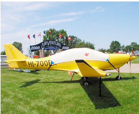
Lancair IV Canopy Cover