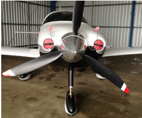
Columbia 350 Engine Plugs