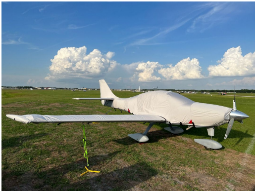
Lancair ES Complete Cover Set

WINTER USE MATERIAL - Made with Solution-Dyed Polyester fabric, this option is intended for seasonal use to aid in deicing, rain mitigation, or for occasional travel. The material is lighter and more compact, but more susceptible to UV damage and may have a shorter useful life if used continuously outside than the all-year use material.