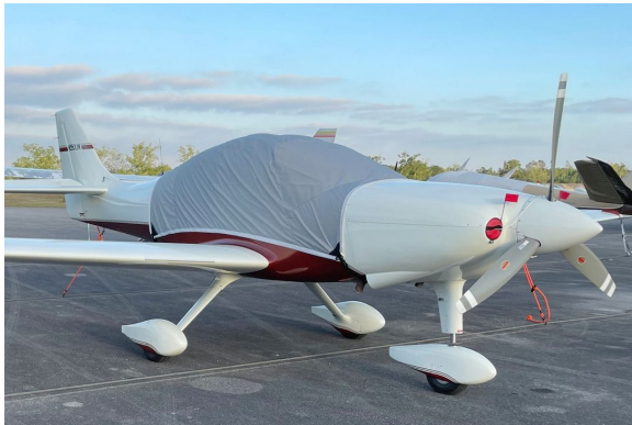
Lancair ES Travel Weight Canopy Cover