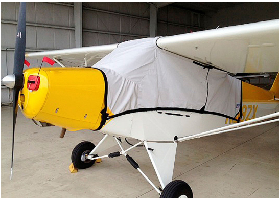
Legend Cub Over-Top Canopy Cover and Engine Plugs