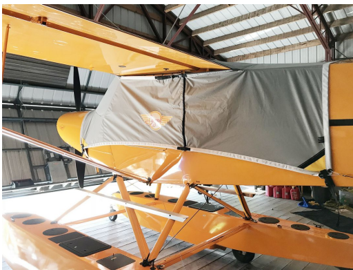
Legend Cub Light Weight Travel Cover

Travel Covers are made with Silver Solution-Dyed Polyester fabric and only lined over the windshield to save weight. The material is lightweight and more compact for easy stowage in the aircraft. The polyester material is water resistant, but only intended for occasional use outside. We also have an ultra lightweight material available for fitted hangar dust covers. For daily outdoor use, the non-travel Sunbrella Cover is the best choice.