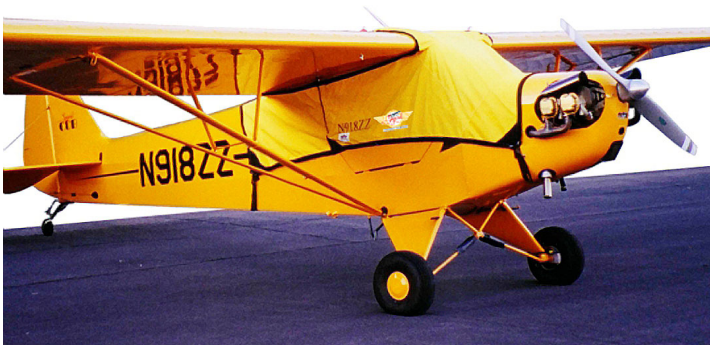
The Legend Cub Canopy Cover (comes in colors)

This cover type is made from Silver Acrylic Sunbrella canvas and is 100% lined with a soft and smooth microfiber. Bruce's Custom Covers developed this material combination especially for aircraft protection. The outer material is medium weight and treated for water resistance, UV resistance and anti-static buildup. The inner lining is a very soft and smooth microfiber to prevent scratching. The material is very reflective, and tests show that the cabin interior temperature can be reduced to near-ambient temperature on the hottest of days. It is water, ice and snow repellent, yet breathable to allow moisture to escape from between the cover and the aircraft surface.