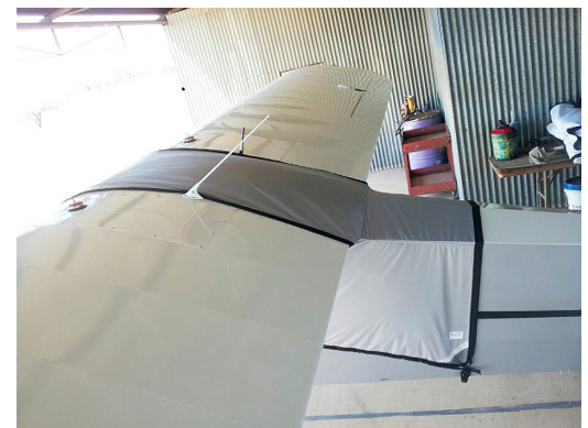
Legend Cub Custom Travel Canopy Cover