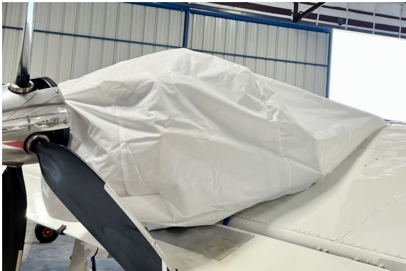
Lockwood Air Cam Engine Cover, test fit cover