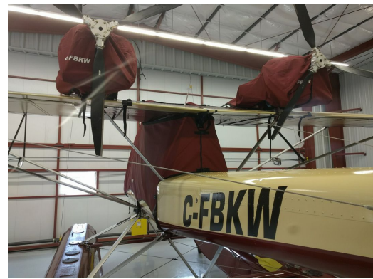
Lockwood Air Cam Canopy Cover, enclosed cockpit style, & Engine Covers