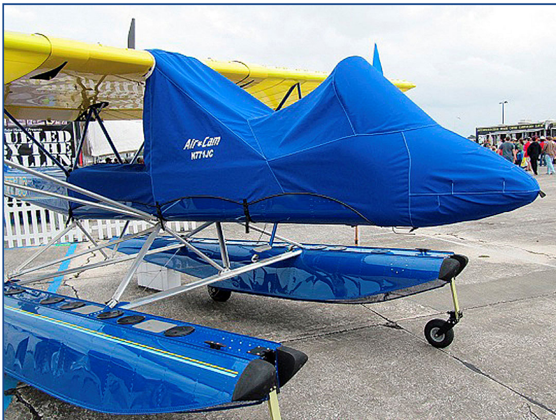
Lockwood AirCam Canopy/Nose Cover w/ aft baggage compartment extension