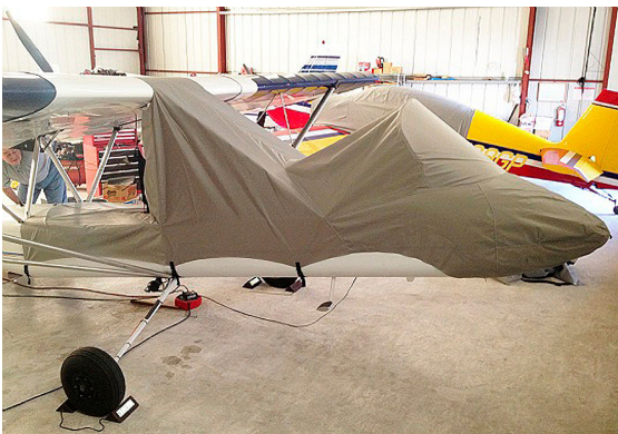
Lockwood AirCam Lightweight Travel Canopy/Nose Cover w/ aft baggage compartment ext