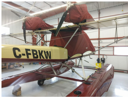
Lockwood Aircam Canopy Cover (fully enclosed bubble), Engine Covers