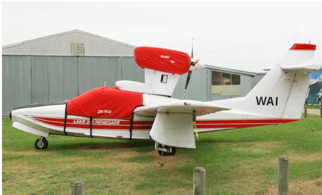
Lake Renegade Canopy & Engine Covers

This cover type is made from Silver Acrylic Sunbrella canvas and is 100% lined with a soft and smooth microfiber. Bruce's Custom Covers developed this material combination especially for aircraft protection. The outer material is medium weight and treated for water resistance, UV resistance and anti-static buildup. The inner lining is a very soft and smooth microfiber to prevent scratching. The material is very reflective, and tests show that the cabin interior temperature can be reduced to near-ambient temperature on the hottest of days. It is water, ice and snow repellent, yet breathable to allow moisture to escape from between the cover and the aircraft surface.