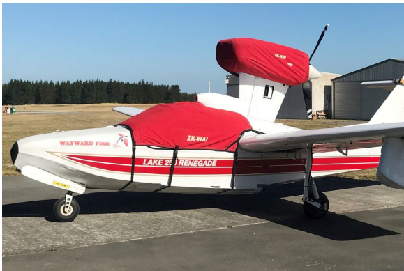
Lake Renegade Cabin & Engine Covers