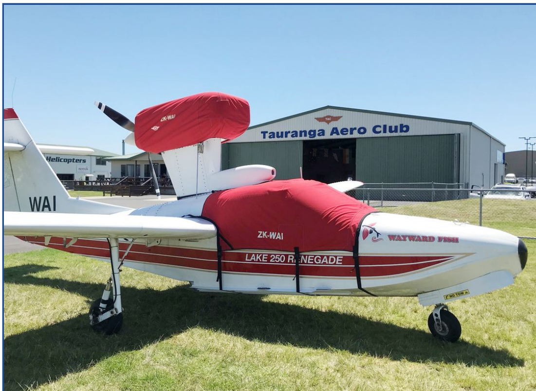
Lake Renegade Cabin &amp; Engine Covers