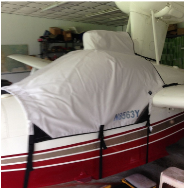
1985 LAKE LA-4-200 Canopy Cover