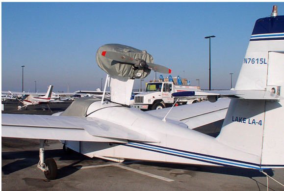
Lake Canopy & Engine Covers

This cover type is made from Silver Acrylic Sunbrella canvas and is 100% lined with a soft and smooth microfiber. Bruce's Custom Covers developed this material combination especially for aircraft protection. The outer material is medium weight and treated for water resistance, UV resistance and anti-static buildup. The inner lining is a very soft and smooth microfiber to prevent scratching. The material is very reflective, and tests show that the cabin interior temperature can be reduced to near-ambient temperature on the hottest of days. It is water, ice and snow repellent, yet breathable to allow moisture to escape from between the cover and the aircraft surface.