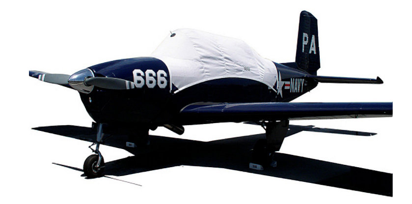
Beechcraft T-34B Mentor Canopy Cover, for 36% Scale Model