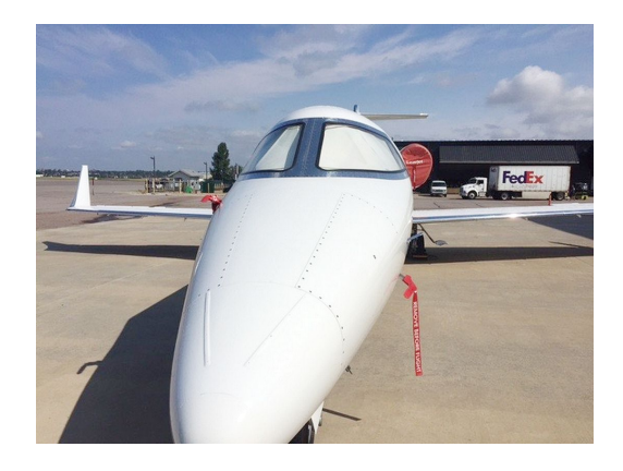
Lear Models 40 & 45 Cockpit Heatshields, Covers All Cockpit Windows

Cockpit Heatshields are interior sunshades for the aircraft's cockpit. The product is a unique composite of closed-cell foam with a silver mylar finish. The semi-rigid design is stiff enough to stand inside the window framing. The set folds up flat and is easily stored in the included storage sleeve. Some designs may require velcro and suction cups. Our Heatshields for jets are offered white side out because some aircraft manufacturers have issued advisories against reflective window inserts due to potential heat damage. A Heatshield is an excellent short-term remedy for cockpit overheating, but an external fabric cover is more effective for long-term protection.