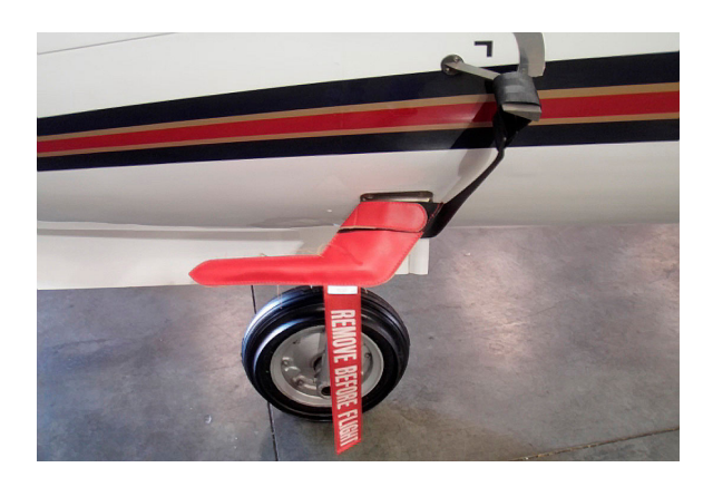
Learjet Heat Resistant Pitot Cover and AOA Strap