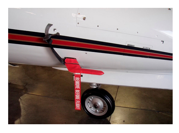
Learjet Heat Resistant Pitot Cover with AOA strap