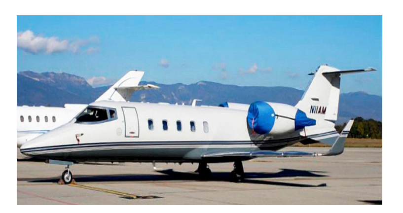
Lear 60 Engine Cover set, comes in colors