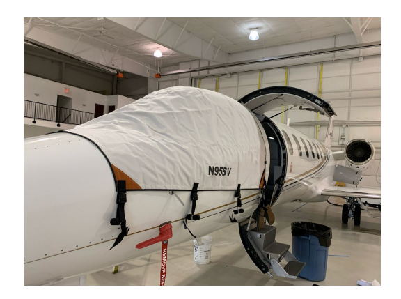
Lear 70 Cockpit Cover