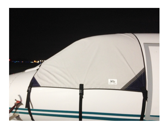
Lear 31 Cockpit Cover

This cover type is made from Silver Acrylic Sunbrella canvas and is 100% lined with a soft and smooth microfiber. Bruce's Custom Covers developed this material combination especially for aircraft protection. The outer material is medium weight and treated for water resistance, UV resistance and anti-static buildup. The inner lining is a very soft and smooth microfiber to prevent scratching. The material is very reflective, and tests show that the cabin interior temperature can be reduced to near-ambient temperature on the hottest of days. It is water, ice and snow repellent, yet breathable to allow moisture to escape from between the cover and the aircraft surface.