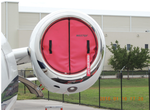
Embraer Legacy 500 Engine Inlet Plug, folding type

The Engine Inlet Plugs are custom fit for your Embraer Legacy 500 Praetor, (EMB-545/550) intakes, made with heavy-duty vinyl material, and stuffed with a single block of sculpted urethane foam. Each plug has a zipper that allows the foam to be removed and dried if necessary. Engine plugs have 'remove before flight' streamers sewn onto the face of the plugs. Most plugs are imprinted with the aircraft registration number in black for an extra charge. Storage bag NOT included. Engine plugs may be inserted after flight when the engine is still warm. Engine Inlet Plugs are commonly referred to as Cowl Plugs, Intake Plugs, Cowl Blocks, Engine Blocks, and Engine Bungs.