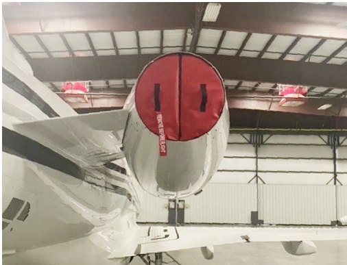
Embraer Legacy 500 Engine Exhaust Plugs, folding type