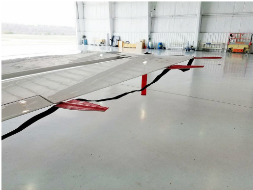
Hawker Beechcraft 800, 800XP, 850XP Static Wick Protectors

The Engine Inlet Plugs are custom fit for your Lear 55 intakes, made with heavy-duty vinyl material, and stuffed with a single block of sculpted urethane foam. Each plug has a zipper that allows the foam to be removed and dried if necessary. Engine plugs have 'remove before flight' streamers sewn onto the face of the plugs. Most plugs are imprinted with the aircraft registration number in black for an extra charge. Storage bag NOT included. Engine plugs may be inserted after flight when the engine is still warm. Engine Inlet Plugs are commonly referred to as Cowl Plugs, Intake Plugs, Cowl Blocks, Engine Blocks, and Engine Bungs.