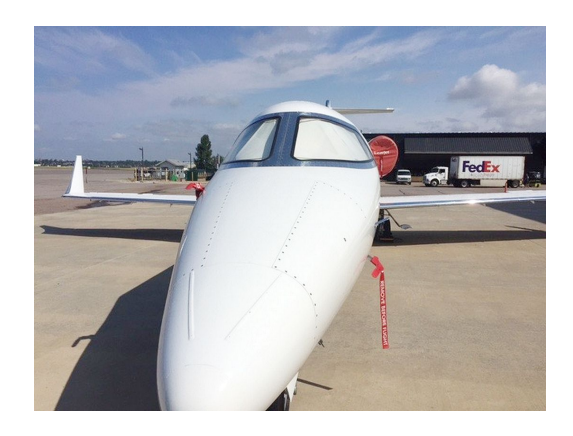
Lear Models 40 & 45 Cockpit Heatshields, Covers All Cockpit Windows