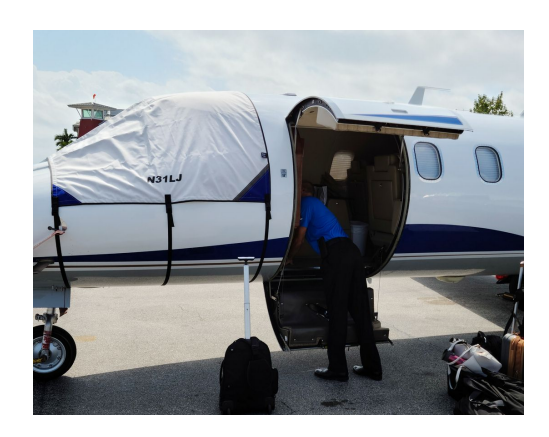
Lear 31A Cockpit Cover