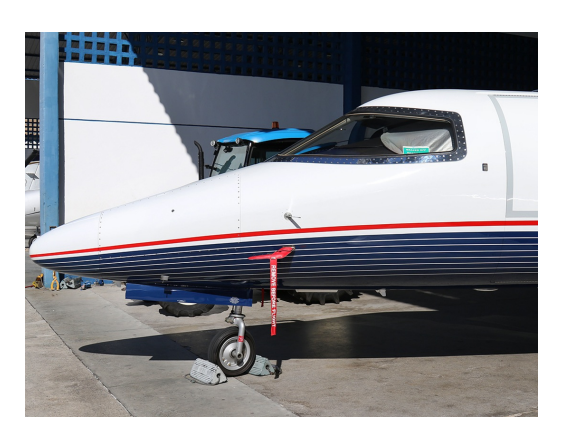
Lear Pitot Cover