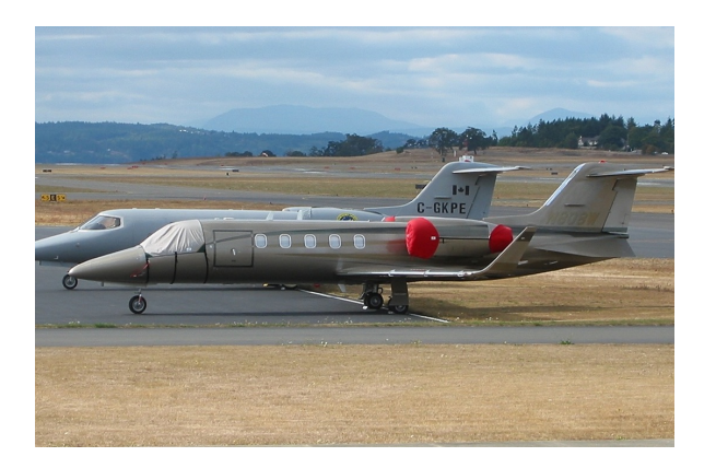
Lear 31A Cockpit Cover, Engine Covers