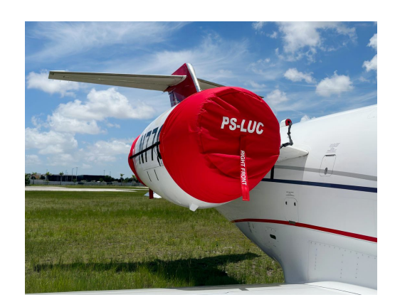
Lear 45 Engine Covers

The Lear Models 40 & 45 Bikini Style Engine Covers are a single-piece design using a soft and smooth stretchy and fabric. The cover stretches tightly over both the intake and exhaust, installing quickly and easily. These covers are designed to be used as hangar dust covers and have a useful life of approximately one year.