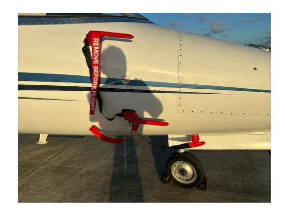
Lear 45 Pitot Cover Set

The Engine Inlet Plugs are custom fit for your Lear Models 40 & 45 intakes, made with heavy-duty vinyl material, and stuffed with a single block of sculpted urethane foam. Each plug has a zipper that allows the foam to be removed and dried if necessary. Engine plugs have 'remove before flight' streamers sewn onto the face of the plugs. Most plugs are imprinted with the aircraft registration number in black for an extra charge. Storage bag NOT included. Engine plugs may be inserted after flight when the engine is still warm. Engine Inlet Plugs are commonly referred to as Cowl Plugs, Intake Plugs, Cowl Blocks, Engine Blocks, and Engine Bungs.