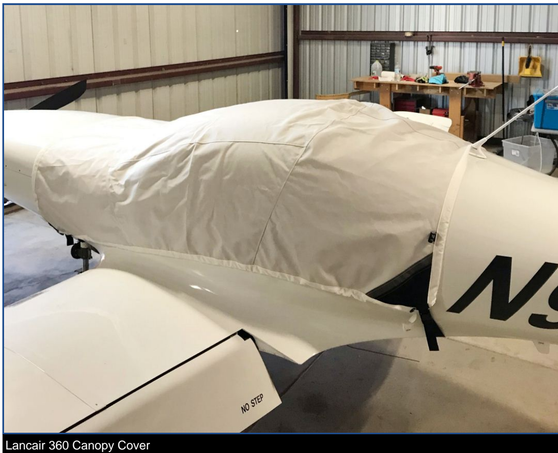
Lancair 360 Canopy Cover