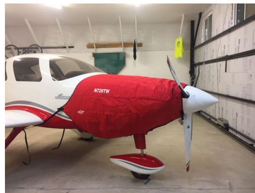
Lancair ES Insulated Engine Cover, Fully Enclosed