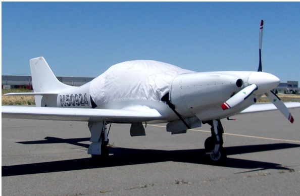
Lancair 320 Canopy Cover

This cover type is made from Silver Acrylic Sunbrella canvas and is 100% lined with a soft and smooth microfiber. Bruce's Custom Covers developed this material combination especially for aircraft protection. The outer material is medium weight and treated for water resistance, UV resistance and anti-static buildup. The inner lining is a very soft and smooth microfiber to prevent scratching. The material is very reflective, and tests show that the cabin interior temperature can be reduced to near-ambient temperature on the hottest of days. It is water, ice and snow repellent, yet breathable to allow moisture to escape from between the cover and the aircraft surface.