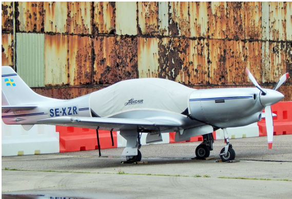
Lancair 320/360 Canopy Cover