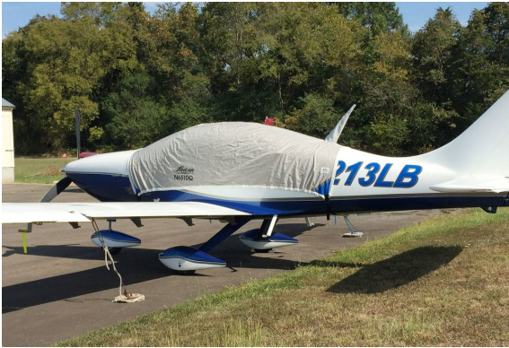
Lancair Columbia 350 Canopy Cover

This cover type is made from Silver Acrylic Sunbrella canvas and is 100% lined with a soft and smooth microfiber. Bruce's Custom Covers developed this material combination especially for aircraft protection. The outer material is medium weight and treated for water resistance, UV resistance and anti-static buildup. The inner lining is a very soft and smooth microfiber to prevent scratching. The material is very reflective, and tests show that the cabin interior temperature can be reduced to near-ambient temperature on the hottest of days. It is water, ice and snow repellent, yet breathable to allow moisture to escape from between the cover and the aircraft surface.