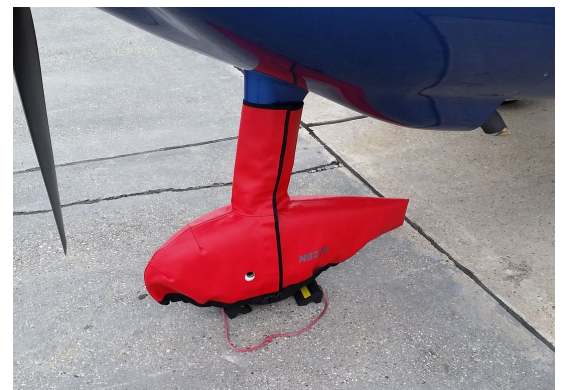
Lancair Columbia Nose Wheelpant/Strut Cover