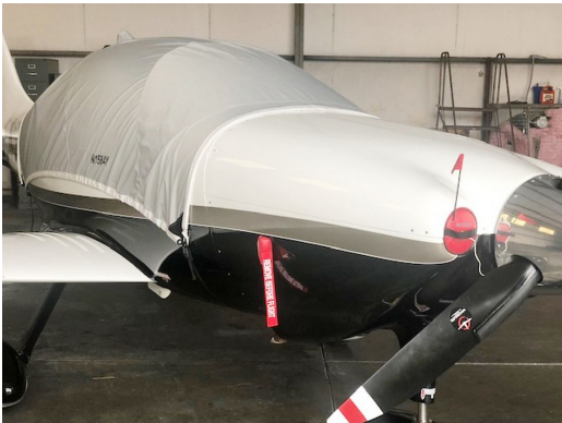
Columbia 350 Travel Cover, Engine Plugs