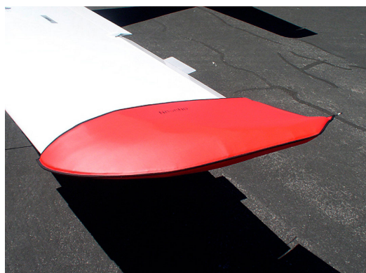
Cessna 350/400 Wingtip Pads

Designed to prevent damage to the aircraft extremities in crowded hangars, these products are made of bright red Naugahyde and thickly padded with a sandwich of closed cell foam.