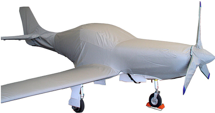
Lancair 320 Complete Fuselage/Wing Cover & Prop Cover

This cover type is made from Silver Acrylic Sunbrella canvas and is 100% lined with a soft and smooth microfiber. Bruce's Custom Covers developed this material combination especially for aircraft protection. The outer material is medium weight and treated for water resistance, UV resistance and anti-static buildup. The inner lining is a very soft and smooth microfiber to prevent scratching. The material is very reflective, and tests show that the cabin interior temperature can be reduced to near-ambient temperature on the hottest of days. It is water, ice and snow repellent, yet breathable to allow moisture to escape from between the cover and the aircraft surface.