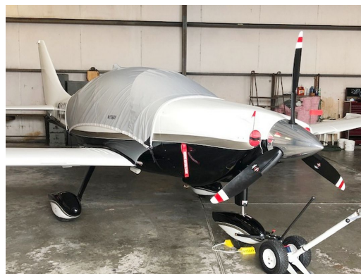
Columbia 350 Travel Cover, Engine Plugs