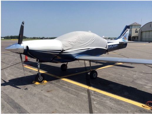
Lancair IV Light Weight Travel Canopy Cover